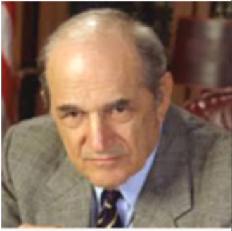
Steven Hill American Actor 1922 - 2016

Steven Hill (born Solomon Krakovsky February 24, 1922 - August 23, 2016) was an American actor. He is best known for his television roles as district attorney Adam Schiff on the NBC television drama series Law & Order (1990-2000) and Dan Briggs on the CBS action television series Mission: Impossible (1966-1967). For the former, he received two nominations for the Prime-time Emmy Award for Outstanding Supporting Actor in a Drama Series.