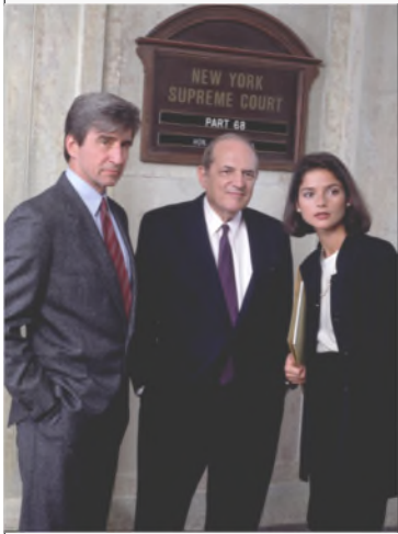
Law and Order cast members Sam Waterston/Jack McCoy Stephen Hill/Adam Schiff Carey Lowell/Jamie Ross

(Continued from page 8) appeared in every episode of the first ten seasons except for "Everybody's Favorite Bagman," which was produced before Hill joined the cast, and the season-seven episode "D-Girl." He appeared in 229 episodes (228 episodes of Law & Order and the Law & Order: Special Victims Unit episode "Entitled") and was the last original character to leave the show's main cast.