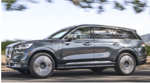
The all new Lincoln Aviator; which fits in between the MKX/Nautilus and the Navigator. A very sweet spot for Lincoln.