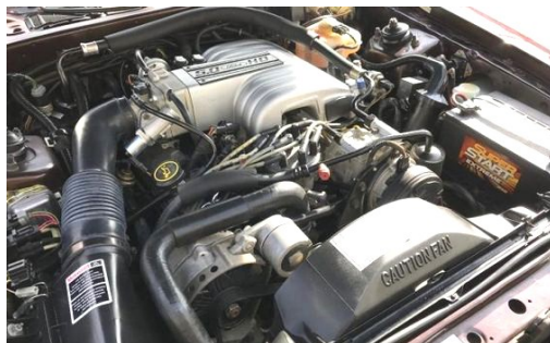
1988 Mark VII engine bay.

The 1987 Mark VII had only minor equipment changes as a much revised Mark VII was expected by midyear. Remember, the Mark VII was now four years old, and sales had fallen far short of expectations. The idea was to give the Mark VII a quick facelift to give sales a shot in the arm. This project never even got started in time for a 1988 model, but there was some serious work done for 1991. This never went anywhere. 1987 production was down to 15,286 due to a short (five month) run.