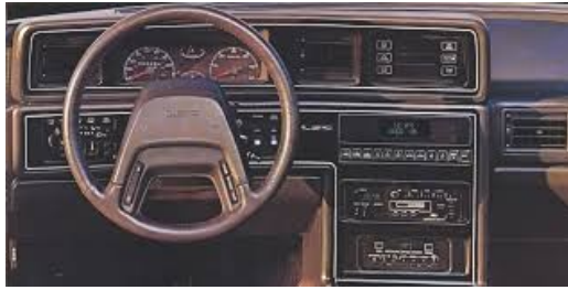
Mark VII dash, everything within easy reach.

virtually shuts down. It only operates in response to real road situations. In hard cornering, you will experience a tremendous amount of body lean, so much that the inside rear wheel picks up. Forward thrust is halted for a moment while waiting for the wheel to touch down. The limitations of the live rear axle coupled with the electronically operated air bags were noted by the motoring magazines when the cars were new and are still a complaint of owners today.