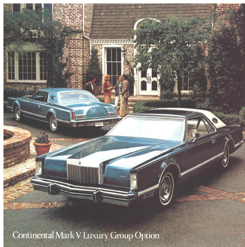
Continental Mark V Luxury Group Option

This was one of Lincoln's best years for cars produced and sold, 113,607 went to happy buyers.