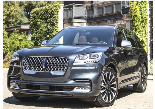
The Aviator carries on many of the styling cues of the other members of the Lincoln product line.

Flying low through the California wilderness, Aviator struck fear in slower traffic just like the chrome-caked grilles of Motor City yore. Of course, this being a Ford product, the grille these days looks more Bentley than Continental Cabriolet. Blue Oval designers have fallen in love with Brit designs of late. Fusions look like Astons, Mustangs like Mondeos, Explorers like Range Rovers — but it could be worse; they could look like a Lexus.