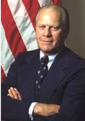
Gerald R. Ford 38th US President A good, honorable man