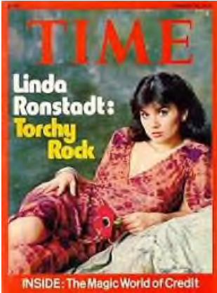
Linda Ronstadt American Pop Singer