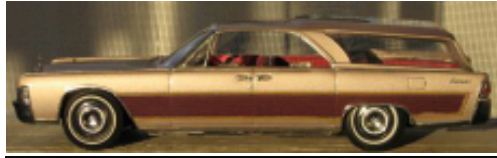
The Welcome Wagon