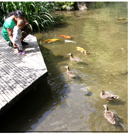
Ducks and Koi in one of the many ponds at the Anderson Japanese Gardens.

pounds and was largely built from International Harvester truck chassis, engine and running gear. The 1967 price was just under $20,000. It had only one door, a rear hatch, which swung upward and passengers enter the car from the rear. Your editor saw it somewhere around 1969 or 1970, when it was on display at a car show here in the Twin Cities. Information of just how many were ever built beyond the first one of each type is not available. A true orphan car, one of these should belong in the