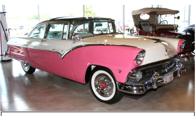
Dahl's collection contains a nice '55 Crown Vic

Harry Dahl has relocated his collection from an older building to some refurbished space at his Ford Lincoln dealership in old downtown La Crosse. It is a fine space which is very well suited