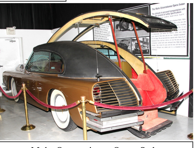
Mohs Ostentatienne Opera Sedan

There is a lot of history from various decades of American life. Part of the museum is dedicated to the