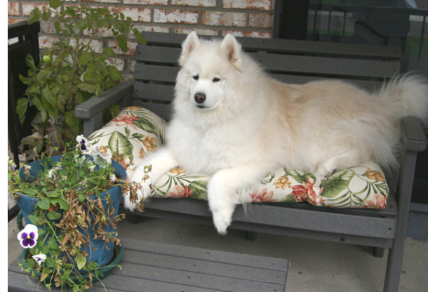
Dad says that the dog days of summer are here. I guess that I feel just like that poor plant looks. tails are on the back page and we hope to see you

great time we North Star members had over in Michigan. On the over and back, the MKT ran well, 70-75 most of the time, except through Chicago on Wednesday afternoon. The adaptive cruise control worked well. keeping me at a very safe distance from the cars