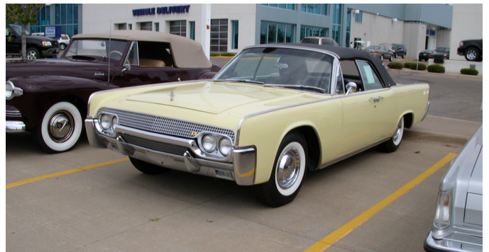
Above Gordy Jensen's finely restored Convertible. Perfect looking in all respects, when running, it even sounds like it did when it rolled out of the showroom door.