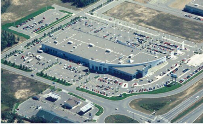
An Aerial View of Mills Motors, Baxter, MN

If you liked great cars, people, facilities, food and wind it was perfect. Four out five categories, minus the wind made for a great event. Mills Motors, our host provided hospitality and generosity which was greatly appreciated by all that attended this car show.