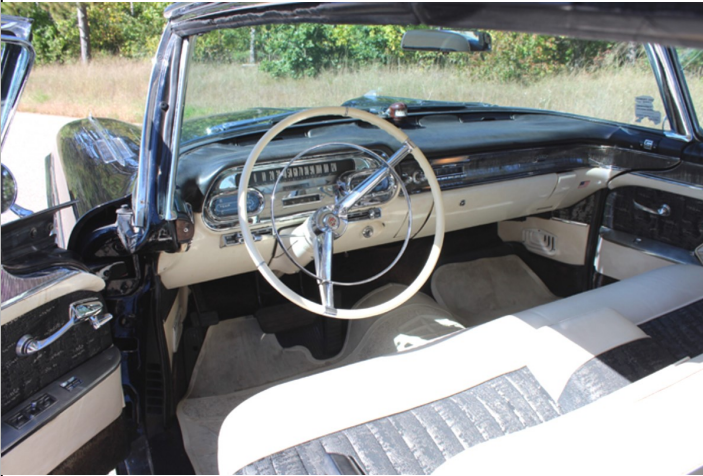
Front seat and dash of the Fleetwood 60 Special