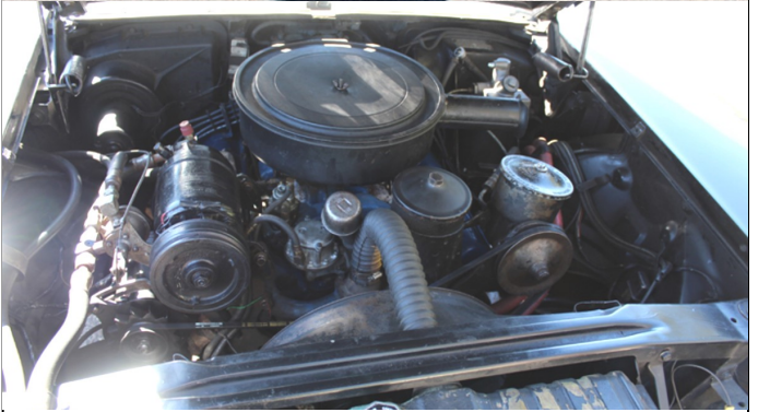
'58 Cadillac Fleetwood 60S engine bay

Feiertag enjoys the attention that the car gets. It's pretty much a one-car motorcade wherever it goes, even on a show field full of other fine machines.