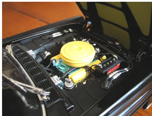
1958 Lincoln Continental Engine Bay

Despite the general availability of parts, there are a few mechanical parts that will prove challenging or expensive to source, like the vacuum pump at the bottom of the oil pump, but Herb has been recreating some discontinued parts in small batches. When it comes to upgrades, he recommends installing a PerTronix ignition system ("They're very forgiving on older cars").