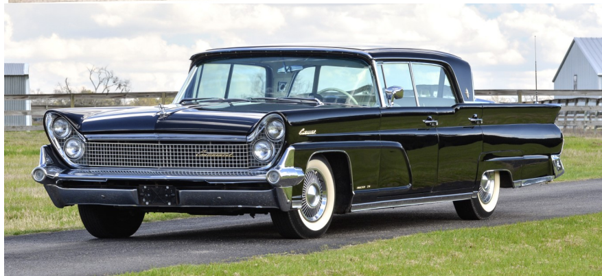
Top 1958 Cadillac Fleetwood 60S, below 1958 Lincoln Continental

Welcome to the Northstar News, the monthly publication of the Northstar Region of the Lincoln and Continental Owners Club. We value your opinions and appreciate your input concerning this newsletter and the operation of the club. This is your club.