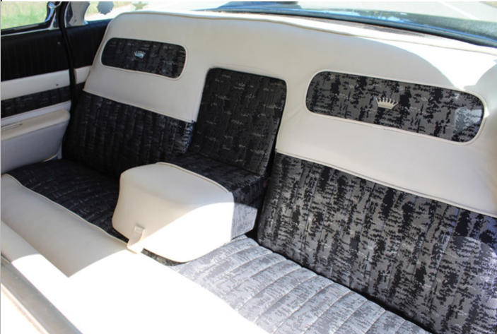
The Cadillac features a spacious and well padded rear seat.

"The one thing that we've had the most problems with is the brake booster. They've been a problem and I guess it's kind of a vertical system. It's been crazy, I just got done replacing that and those things are expensive as heck! And it's been about the fourth one I've replaced. I dunno, I just can't seem to get one to last. Otherwise, it's just the regular stuff — brakes, tires, that sort of thing. I do have to get the air conditioning fixed. It worked up until last fall. I've got a problem in there now and I need to get that worked on. It's factory air, so that's kind of cool."