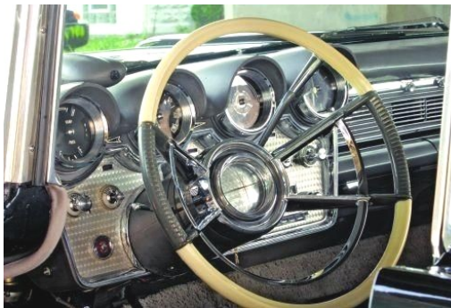
The 1958 Continental Dashboard, a bit busy looking, but it is all there.

Their unusual size meant that the Lincoln brakes were unique in the Ford family of products, and while this may cause confusion for some Ford parts suppliers, those in the know say that new shoes and hoses can be sourced, along with used but serviceable drums.