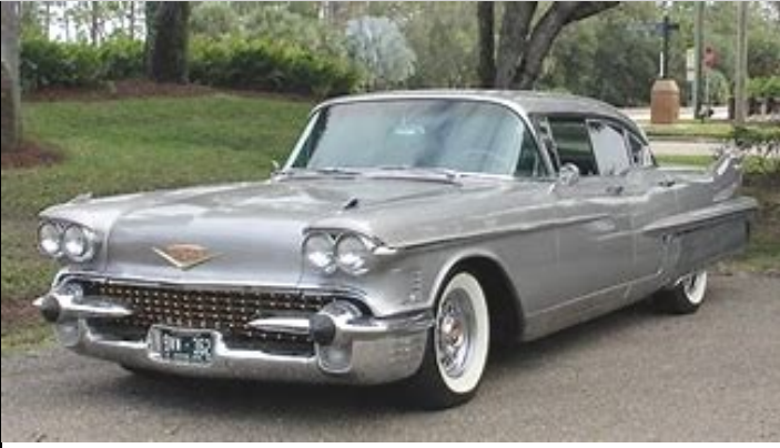
No mistaking this 1958 Cadillac 60 Special for anything else...

The Cadillac Sixty Special is a name used by Cadillac to denote a special model since the 1938 Harley Earl–Bill Mitchell–designed extended wheelbase derivative of the Series 60, often referred to as the Fleetwood Sixty Special. The Sixty Special designation was reserved for some of Cadillac's most luxurious vehicles. It was offered as a four-door sedan and briefly as a four-door hardtop. This exclusivity was reflected in the introduction of the exclusive Fleetwood Sixty Special Brougham d'Elegance in 1973 and the Fleetwood Sixty Special Brougham Talisman in 1974, and it was offered as one trim package below the Series 70 limousine. The Sixty Special name was temporarily retired in 1976 but returned again in 1987 and continued through 1993.