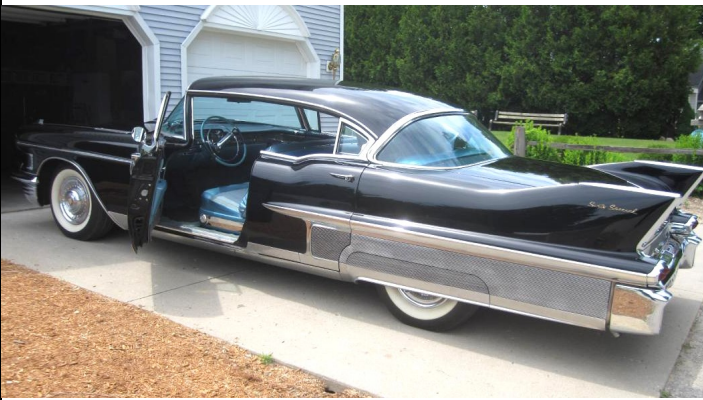
The '58 60 Special features a lot of chrome on the rear quarters, plus some fins, reaching for the sky. Quite a look!

The Cadillac Sixty Special is a name used by Cadillac to denote a special model since the 1938 Harley Earl–Bill Mitchell–designed extended wheelbase derivative of the Series 60, often referred to as the Fleetwood Sixty Special. The Sixty Special designation was reserved for some of Cadillac's most luxurious vehicles. It was offered as a four-door sedan and briefly as a four-door hardtop. This exclusivity was reflected in the introduction of the exclusive Fleetwood Sixty Special Brougham d'Elegance in 1973 and the Fleetwood Sixty Special Brougham Talisman in 1974, and it was offered as one trim package below the Series 70 limousine. The Sixty Special name was temporarily retired in 1976 but returned again in 1987 and continued through 1993.