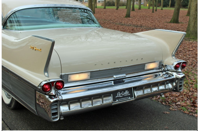
A closer look at the rear of the 60 Special. Note the detail of the rear bumper, back-up lamps and exhaust ports.

the trunklid. Engineering treats included moving the optional air conditioning unit from the trunk to a space under the hood, and a foot-operated parking brake that released when the car was put in gear. The 365 cu in engine introduced last year was now bumped up to 300 hp.