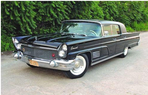
Pictured... 1958 Lincoln Continental

design, massive stretch-out room, and distinctive styling. With prices on their forebears and followers rising by the day, now is the time to aim for middle ground and pick up a 1958-'60 Continental.