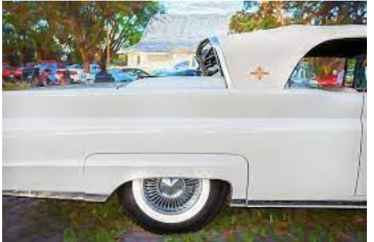
Right rear side detail, 1958 Lincoln Continental

I was a car-crazy 10-year-old when the 1958 Lincoln Continental came out. Growing up in Homewood, Ill., I was known as the kid in school who doodled cars everywhere. My dad sold insurance, and the local Lincoln-Mercury dealer was one of his customers. One day I begged him to take me with him on a sales call because I wanted to see the new Lincoln. Even then, I liked the way it looked. Dad never bought a Lincoln; he couldn't afford one. This was back when the notion was that you'd work your way up a car company over the years; you'd start out at Ford, segue to Mercury and end up at Lincoln. Dad never made it past Ford.