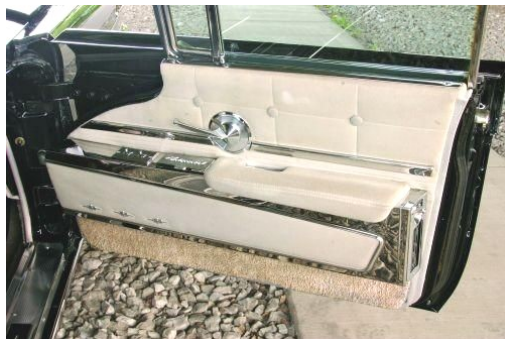
Shown... Right front door panel, massive in size. It contains two window motors and other hardware.

the left rear and right front floors. The complex, fully automatic top, which incorporates a power-retracting reverse-slant rear window like the Sedan, Landau, and Coupe, can weaken and become loose with age, with damaging results. According to Herb, "The scissor mechanism located above the driver's head, which supports the center top bow in the side rail, can fold inward instead of up and away, bending the frame and worse. You can avoid this by pushing up against the top crossbow directly above you after the windshield clamps unlock and keeping a steady pressure on the bow until it has hinged upward, away from the frame." Replacement bushings, hinges, and top cylinders are available, as is new top material.