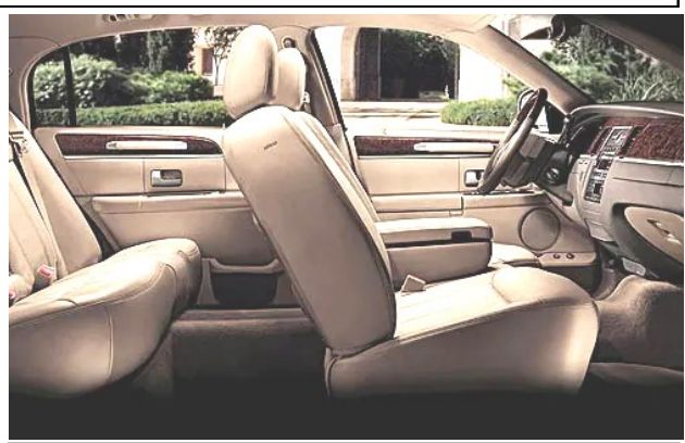
The Town Car interior was not lavish, but tastefully elegant in its own way.

The third generation of the Town Car marked several major changes within Lincoln-Mercury. From 1999 to 2002, the Lincoln-Mercury division became a brand of Premier Automotive Group, a division of Ford created to manage its premium automotive brands acquired during