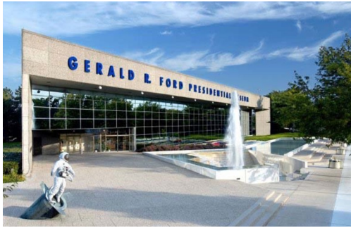
Gerald R. Ford Museum