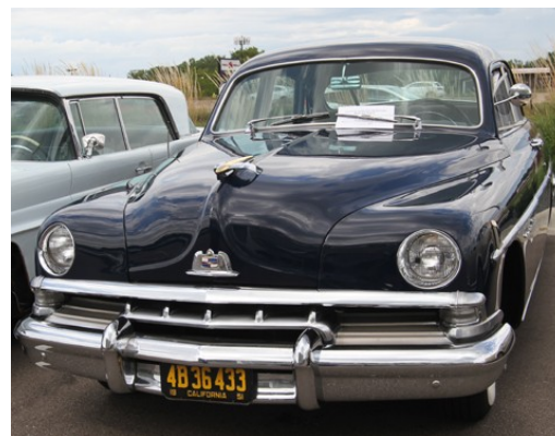
1951 Lincoln Cosmopolitan, best of show

People's Choice Awards were given out at the end of the show for the three cars; which did their best to capture the hearts of those who attended.