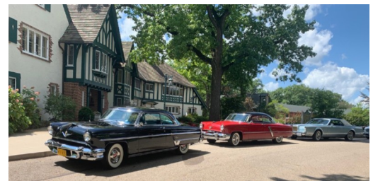
Lincolns at the Kellogg Manor House

The Road Race Lincoln Register hosted 2019's Lincoln Homecoming August 7 through the 12th, 2019. The decision was made early on in the planning that we wanted to change it up this year by inviting all Ford products to the show. We welcomed 125 members and their families from all four Lincoln clubs plus Ford, Edsel, and Mercury for this first time event featuring all Ford-built automobiles. All in all, the event was a success; however we were a little disappointed in the turnout of non-Lincoln cars. The non-Lincolns that did show were high quality and pretty diverse. While many of us arrived Monday to help set up registration and get organized for the week's activities, Wednesday was when our first event took place. Some of our group drove out to the Gilmore Museum for their weekly cruise night. There was a large turnout of local cars of all types and ages, and the evening was perfect! Those that choose to stay at the hotel got to enjoy a welcoming party with free appetizers and a cash bar.