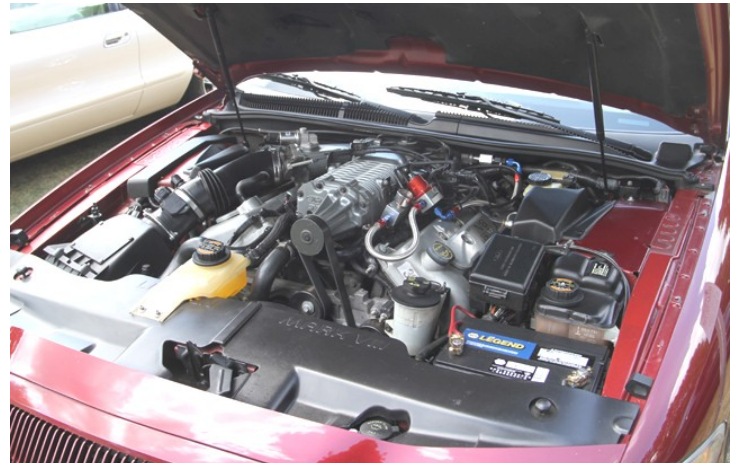
Not your typical Mark VIII, this one features a belt driven supercharger, which makes the Mark VIII, normally a quick car, even quicker. Several of the Mark VIII at the show were supercharged.