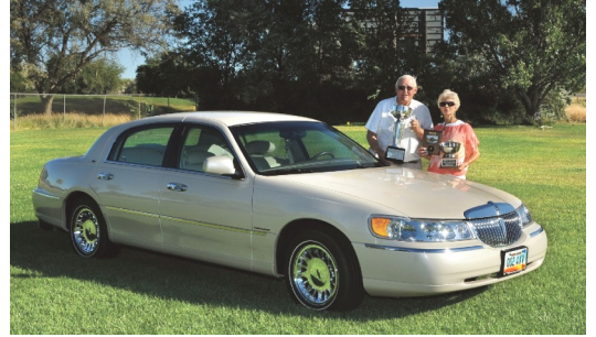
Another view of a great couple with their exceptional Town Car.