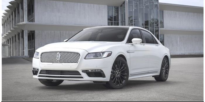
Above, understated elegance, the Lincoln Continental. Below, the perfect sized SUV, the new Lincoln Nautilus.

DEARBORN, Michigan, Sept. 12, 2019 – Lincoln Continental and Lincoln Nautilus continue to impress and meet the discerning expectations of luxury clients. Based on owner feedback, Lincoln Continental has earned best-in-class honors for luxury cars in AutoPacific's 2019 Ideal Vehicle Awards while Lincoln Nautilus takes the top spot among executive luxury SUVs.