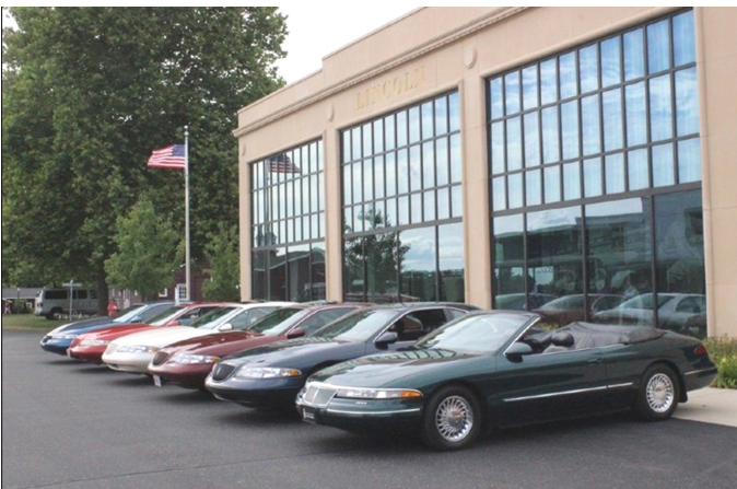
There were eight Mark VIII at Hickory Corners, here are six of them lined up in front of the museum. The first one, a nice dark green in color, is a custom convertible.