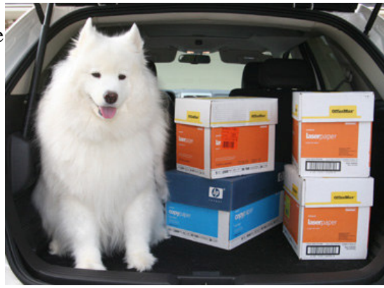
Faithie in the back of the MKX, looking over the printer paper we just got at Office Max.

Soon, the 2008 Lincolns will be appearing in the showrooms. Now is a good