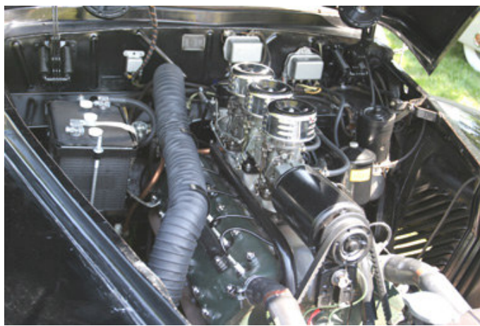
Three - two throated carburetors really add a nice touch.

Forward about 17 years and a number of collector cars have passed through my garage but I can't part with the '47.