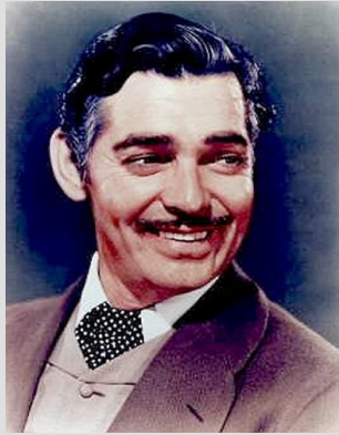
Clark Gable 1901 - 1960

William Clark Gable was an Academy Award-winning American film actor. In 1999, the American Film Institute named Gable seventh among the Greatest Male Stars of All Time. He has been nicknamed "The King of Hollywood." His most famous role was in the 1939 film Gone with the Wind , in which he starred with Vivien Leigh.