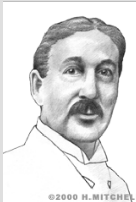
King C. Gillette

At the last turn of the century, King Gillette founded what would become a corporate giant, based on a simple yet essential invention: the safety razor with disposable blades.