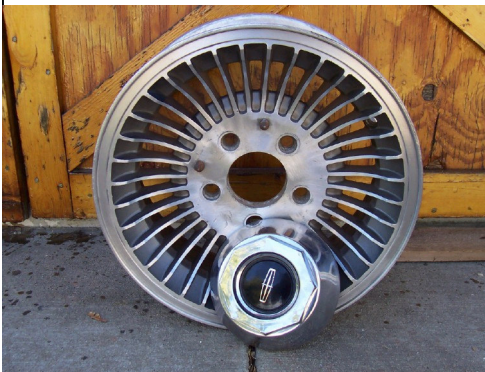
Lincoln Turbine Wheels