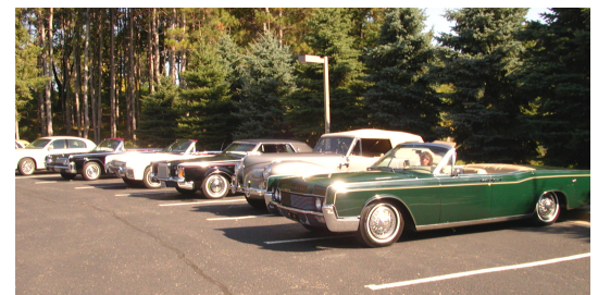
Lincoln's on display at Environments

Once again, on September 11 th , we returned to Roger and Barb's Environments in Minnetonka for the annual Northstar picnic. The weather was perfect and the food was good. Roger did a great job with the food, grilling up boneless pork chops and chicken, which was done to perfection. We had 25 Lincolns in the parking lot, ranging from the early 1940's to a 2004 model. We also had a few other interesting brands, including a neat Mercedes Benz SL380, an older Rolls Royce, complete with built-in picnic tables, and a new Thunderbird. As usual, this was well attended, with 62 members showing up for the afternoon.