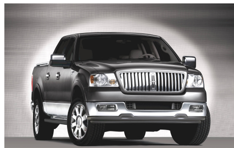
2005 Lincoln Mark LT Pickup Truck

Lincoln Mark LT combines the luxury and design elegance of Lincoln with the functionality of a pickup truck. Lincoln Mark LT is part of Lincoln Mercury's plan to introduce 11 new products in six segments within the next four years. The Lincoln Mark LT is a key part of Lincoln's plan to broaden the showroom and build momentum and profitable growth by introducing 11 new Lincoln Mercury products in six segments within the next four years. On sale in early 2005, the new Mark LT is one of five new Lincolns that will be introduced in that time.