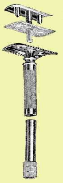
Early Gillette Safety Razor

The Gillette family moved to Chicago in 1859; then in 1871, after the Great Fire destroyed their hardware supply business, they moved to New York City. At the age of 17, Gillette became a traveling salesman, who made improvement to his wares as well as selling them. By 1890, he had earned