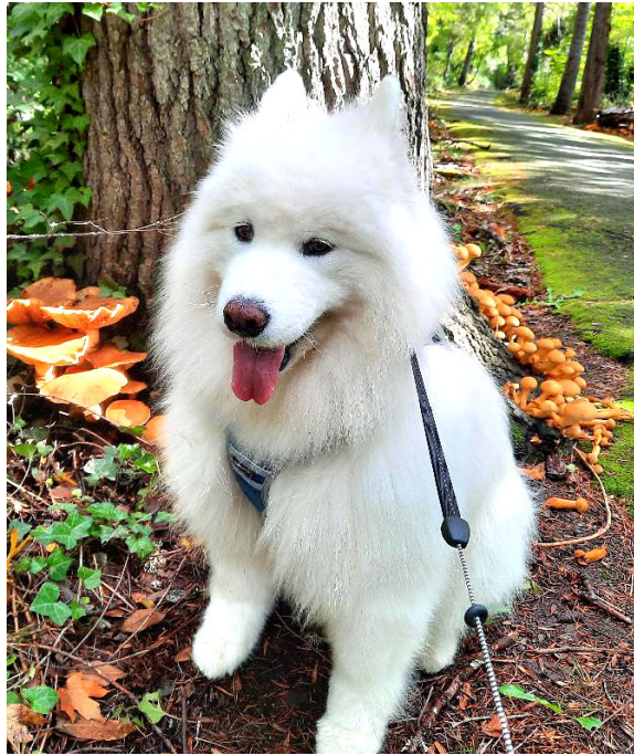
Hugz, our West Coast correspondent, is out for an early morning walk through a heavily wooded area near Portland. He loves his walks, especially in this area, which has a lot of squirrels, birds, rabbits, and other interesting attractions. Note the mushrooms growing on the trees. Not many people are ever on this particular trail. Hugz likes that, he is a little fellow "who likes to take the trails less traveled."