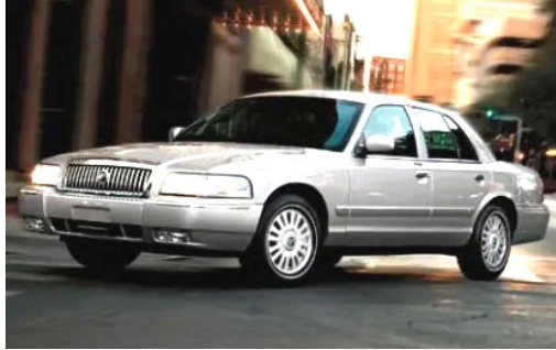
2010 Mercury Marquis in New York city.

From the Denver Post and via the internet. First published, June 17, 2010, with the title "Hello New York, goodbye Mercury."