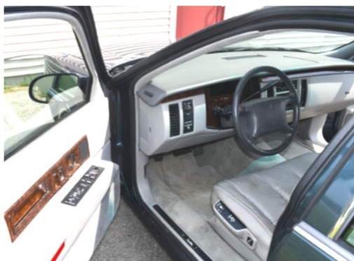
Front seat and dash of the Fleetwood. Quiet luxury all the way.