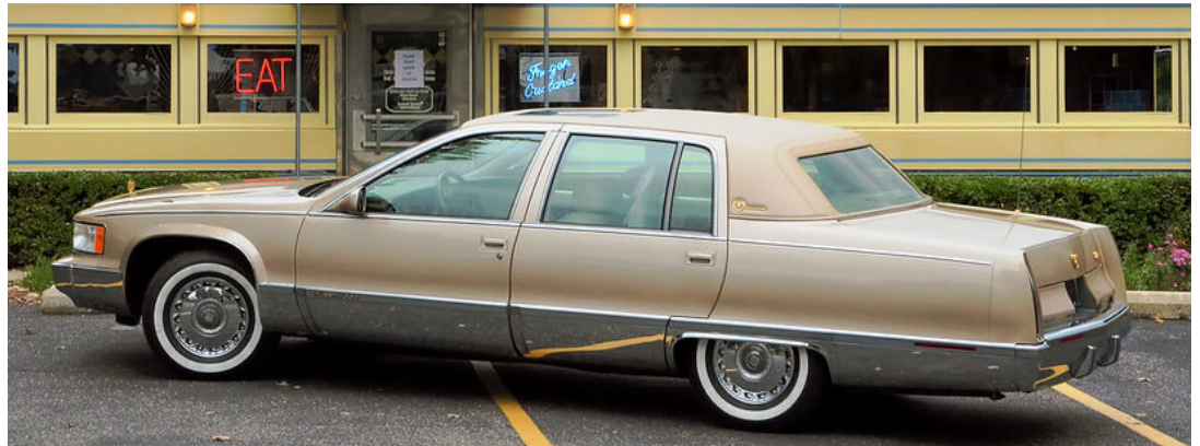
The best of the best for the '90s, The 1997 Lincoln Town Car and The 1996 Cadillac Fleetwood Brougham.

Welcome to the Northstar News, the monthly publication of the Northstar Region of the Lincoln and Continental Owners Club. We value your opinions and appreciate your input concerning this newsletter and the operation of the club. This is your club.