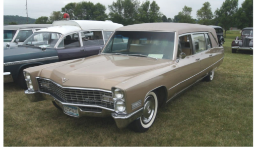
Above: 1967 Cadillac Funeral Coach