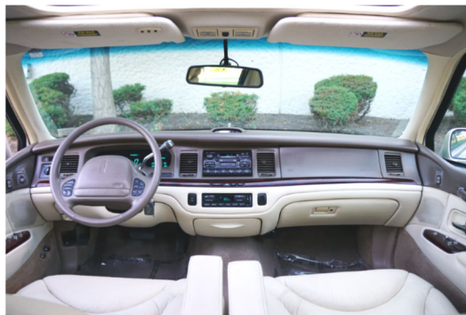
1997 Town Car front seat area and dash.

had as options anyway. If there is a single attribute that places the Town Car above the rest of the cars in this class, it is sheer interior spaciousness. The Town Car's interior is simply huge.