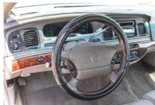
Well designed dash of the Grand Marquis puts all controls within easy reach of the driver.

the papers to drive away in what amounts to an updated version of a family car of the 1960s?