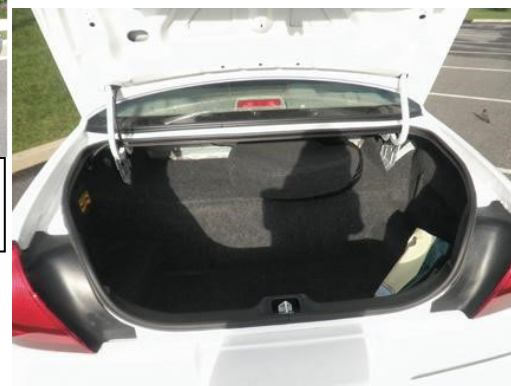
The Mercury, like the Lincoln and Ford features a very large trunk.

You bet they do. Ford sold more than 200,000 copies of the Grand Marquis and Crown Vic last year, comparable to the sales of all Chrysler-brand cars, and many of those went to repeat buyers. They like the old-style 4.6-liter V8 with its 190 horsepower and the room for six people. They love the monstrous trunk.