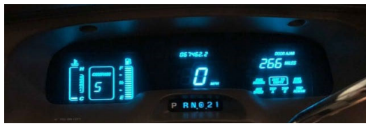
The Town Car digital instrument panel.

The instrument panel uses blue-green electronic digital readouts for all of the instrumentation, which is somewhat incongruous in a car like this, but they are large, easy to read, and not cramped together. The main display is recessed and hooded so that sunlight never obscures the information, and some of the lenses have been changed to reduce reflection and glare on 1997 models.