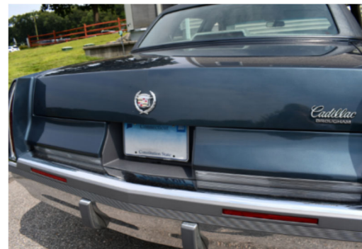
Nothing overly fancy regarding the styling of the rear end of the Fleetwood. Sometimes simple is best.

guard door beams and a reinforced safety cage surrounding the entire passenger compartment. Front and rear crumple zones were designed to accordion at a controlled rate, cancelling collision energy before it reached the passenger compartment. The 1993-1996 Cadillac Fleetwoods were as rugged as they were beautiful and as efficient as they were rewarding to drive. Production totals are the following: 1993 – 29,744 vehicles, 1994 – 23,177 vehicles, 1995 – 13,445 vehicles, and 1996 – 12,596 vehicles.