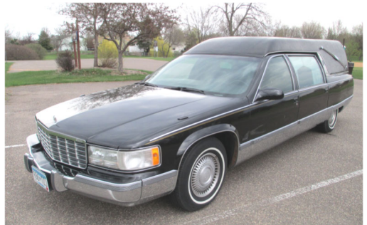
Above 1995 Cadillac Funeral Coach Below 1976 Cadillac Limo

I have worked at Cub Foods for a long time. I started collecting cars when I was 20 years old. My first old car was a 1967 Cadillac Coupe deVille. I have owned several Cadillacs over the years and I still enjoy the 1969 deVille Convertible.