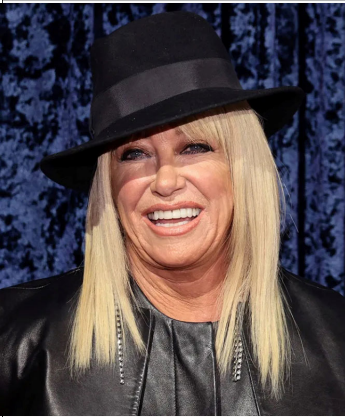
Suzanne Somers American Actress 1946 - 2023

Suzanne Marie Somers (October 16, 1946 - October 15, 2023) was an American actress, author, singer, businesswoman, and health spokesperson. She played the television roles of Chrissy Snow on Three's Company (1977-1981) and Carol Foster Lambert on Step by Step (1991-1998).