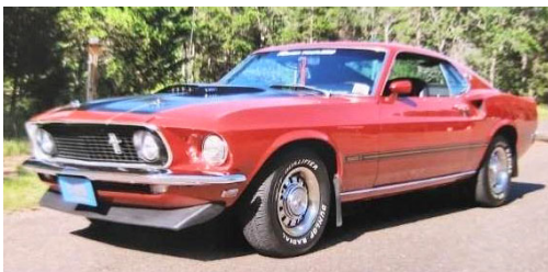
The Sperry's Mustang Mach I

I am pleased to introduce Michael and Judy Sperry , 8009 Fairground Road, Webster, WI 54895, 715-245-3496, mksperry1@gmail.com , or Michael Sperry on Facebook . Besides their clean green 55,000 mile 1969 Lincoln Continental Mark III, the Sperry's have a very interesting collection of awesome vehicles. These include a very low mile 1969 Mustang Mach 1, a 1970 SS396 El Camino now with a 496 cubic inch V8, a clean California 1972 Chevrolet K2500 pickup, a 1986 Toyota Sunland Express mini RV, a 1985 Pontiac Firebird Super Pro 960 horsepower drag racing car, several motorcycles, and Judy's 2004 LS 430 Lexus. They have had the 21,400 mile Mach1 since 1975 and have enjoyed taking the Mustang, the Mark III, and the El Camino on the Hot Rod Power Tours. The Mark III came from Edina, MN, and provides a smooth stately ride. Mike has dealt with all aspects of auto body paint and repair for over 40 years. If you have any questions about how to make your vehicle look better or go faster, contact Mike. Now, Mike will tell you about the Sperry's and their Mark III.