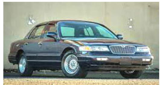
From any angle, not a bad looking car.

In the 1998 redesigns, the Town Car's trunk will lose nearly two cubic feet of cargo room. The way the rear window slopes down cuts into space at the back of the trunk. The '98 Mercury's rear window design is similar, but the trunk will turn out to be the same size as the '97.