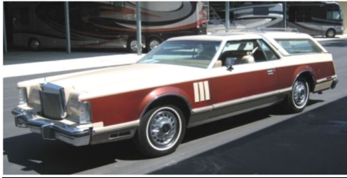
The Welcome Wagon.....