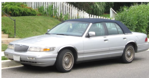
The Mercury Marquis, the top of the line model for 1997.

Editors note: Throughout the long run of the three generations of Town Cars, the Ford Crown Victoria and the Mercury Grand Marquis were always nipping at their big brother, the Town Car's heels. All three were good cars in their own right. The Crown Vic was the finest Ford offered in its product line. When buyers "graduated up to Mercurys." The Grand Marquis was available to satisfy their choices. If the ship came in, and money was not a problem, the choice was simple. It clearly was the Town Car. Close up; there were some similarities between the three models. A lot of similar mechanical stuff, and of course, the 4.6-liter engine. All three were easy to repair, and parts were always easily obtained. Even today, all three are prized by entry-level collectors as great tour cars for many of the above reasons. And because a lot were manufactured over their nine-year model run, prices are a little lower than many other models. Now, here is one person's opinion about the 1997 Grand Marquis.