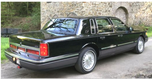
1997 Lincoln Town Car.

(Continued from page 4) rear ashtrays, robe cords on the seatbacks, the trunk key cover, an extra power point underneath the dashboard, cellular phone wiring, etc.).