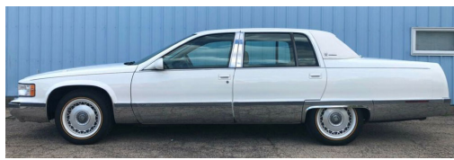
The Cadillac Fleetwood, one of the direct competitors to the Town Car. The last of the rear wheel drive cars produced by Cadillac.

Cadillac Motor Division redesigned the 1993-1996 Fleetwoods as the new age luxury sedans. The Brougham was again a member of the Fleetwood Series. These regal sedans were spacious and elegant, not to mention highly efficient. With their traditional full-size luxury and Cadillac style, they were immediately identified in any gathering of fine cars. These sedans were available as the base Fleetwood and the Fleetwood Brougham models.