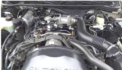
The Lincoln features a 4.6 Liter, single overhead camshaft engine, also found in Ford and Mercury automobiles.

Driving Impressions - Like many luxury cars these days, the Lincoln Town Car has a single powertrain combination, a 4.6-liter single overhead cam V8 that makes an adequate 190 horsepower (210 in the dual-exhaust Cartier version) and a useful 265 pound-feet of torque (275 for the Cartier), coupled to an electronically controlled four-speed automatic transmission. While these engines are adequate for the need of most Town Car customers, even those who tow light trailers, they are not a competitive match for the powertrain sophistication found in the Cadillac Northstar engine—275 or 300 hp—or most of the import entries in this class.