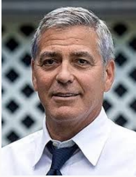
George Clooney American Actor