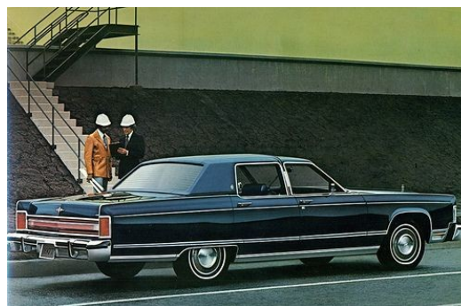
Fairly clean styling, the biggest car for 1977, Lincoln was set apart from its competition.

I'll never forget the day I drove it off the used car lot at Mallory Buick, where my aunt Annette Kompir was a billing clerk. As I pulled the behemoth out onto Page Avenue heading east, I felt like the captain of the Queen Mary. The Lincoln star atop the Rolls Royce style grill, newly introduced for the 1975 restyle, seemed to guide the way as I maneuvered the 5,400-pound land yacht over the sea of concrete stretched out in front of me.