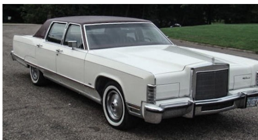
The Kunz Lincoln, a real land yacht.

Cadillac may have claimed the title "standard of the world," but Lincoln ad men had their own line that stated the Lincoln was "A standard by which luxury cars are judged." Apparently, the age-old, Chevy versus Ford rivalry went right on up to their top-of-the-line marques.