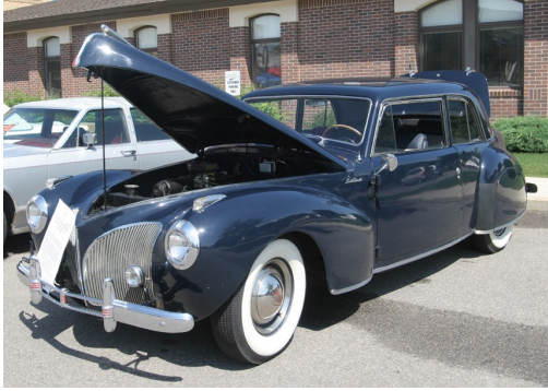
Mary Tod on display at the Montgomery, Minnesota Car show in July, 2011

thing in the morning, after all, I was their high bidder and deserved to know if I was in the ballpark.