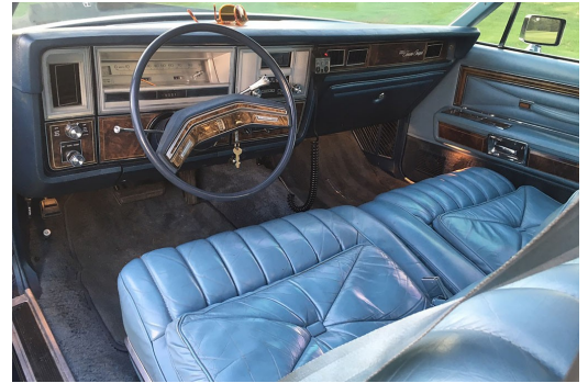
Luxurious seating abounds in the Lincoln, truly a living room on wheels.

When I pilot my land yacht, people always stare. Watching a car the size of an aircraft carrier float by is not a common sight these days. One of the most frequent questions I get from people is whether a car this large is difficult to drive. Surprisingly, however, the answer is no. Lincoln built these cars to be driven easily by little old ladies -- and in fact, they're actually better to drive than modern cars in many ways.