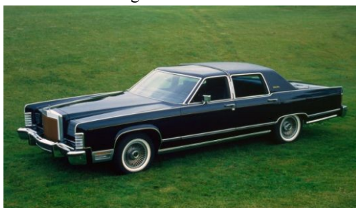
If you wanted a big luxury car in 1977, Lincoln was your brand of choice.