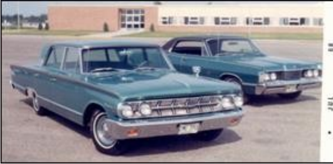
Another view of the 63 and the 68 Park Lane Brougham in the background. Two very fine Mercurys. During these years, Mercury was at the top of their game.

power roll down rear window; just like the 1958-1960 Lincoln Continentals and similar to the 1957 Mercury Turnpike Cruisers. I sold the '56 Chevy for $800 and got a family discount price on the 1963 Monterey. I liked the '63 while my parents owned it and liked it even more now. The flow through ventilation was a great feature especially in hot weather, and the power of the 390 V8 was very good. I kept the Monterey in like new condition.