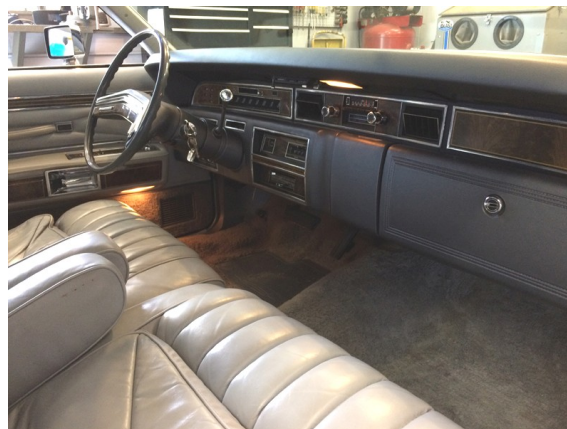
Inside or out.. This is one very nice Lincoln.

It runs out just beautifully, and driving is what I expect to do a lot of in the months ahead. Good things come to those who wait!