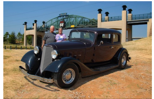
At the Route 66 Bridge in Tulsa, OK. LCOC Mid-America 2013.