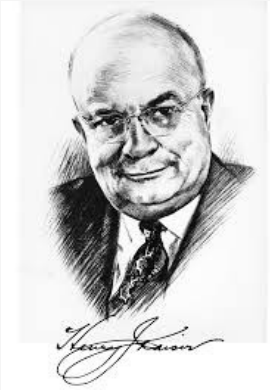
Henry J Kaiser 1882 - 1967 Renown Industrialist

American industrialist who became known as the father of modern American shipbuilding. He established the Kaiser Shipyards, which built Liberty ships during World War II, after which he formed Kaiser Aluminum and Kaiser Steel. Kaiser organized Kaiser Permanente health care for his workers and their families. He led Kaiser-Frazer followed by Kaiser Motors, automobile companies known for the safety of their designs. Kaiser was involved in large construction projects