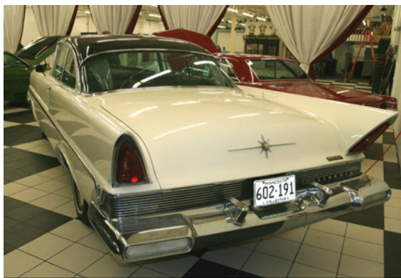
57 Capri at Classic Rides and Rods. It could be yours for $22,995.