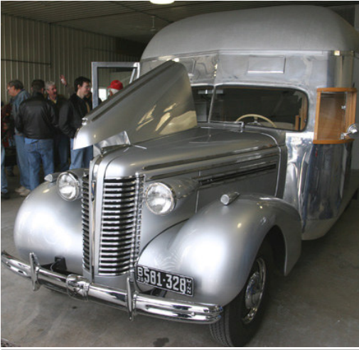
The Buick House Car

together by airplane rivets and a wood trimmed interior. It looks like a rather quaint lake cabin on the inside. Built as a prototype, for various reasons, it never saw