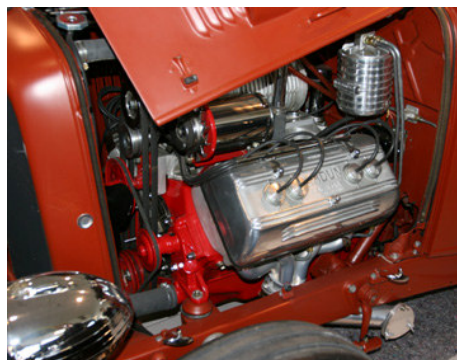
Early Ford V8 with Ardun Head