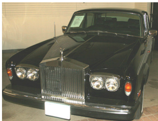
Former Carl Polhad 1980 Rolls Royce.