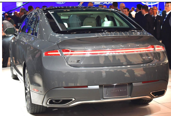
2019 Lincoln MKZ Rear View, simple but elegant