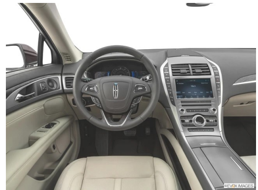
A "behind the wheel" view of the 2019 MKZ dashboard.

2013 MKZ concept car was unveiled at the 2012 North American International Auto Show.