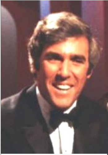
Burt Bacharach American Composer 1928 - 2023

Burt Freeman Bacharach ( May 12, 1928 - February 8, 2023) was an American composer, songwriter, record producer, and pianist who is widely regarded as one of the most important and influential figures of 20th-century popular music. Starting in the 1950s, he composed hundreds of pop songs, many in collaboration with lyricist Hal David. Bacharach's music is characterized by unusual chord progressions, influenced by his background in jazz harmony, and uncommon selections of instruments for small orchestras. He arranged, conducted, and produced much of his recorded output.