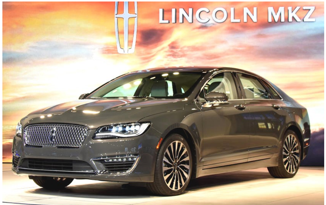
Shown, a 2019 Black Label MKZ

Welcome to the Northstar News, the monthly publication of the Northstar Region of the Lincoln and Continental Owners Club. We value your opinions and appreciate your input concerning this newsletter and the operation of the club. This is your club.