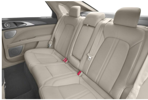
Rear seat interior of the 2019 MKZ

The MKZ was originally set to be released in November 2012, but this was set back to January after Fusion production was delayed, which is produced at the same plant. Its release date was again pushed back after Ford looked to iron out any possible quality issues. Some MKZs were even shipped from the Mexican facility to Ford's Flat Rock plant to be reassured and inspected that they were ready to be sent to dealerships. This was an unprecedented move for such a big product launch, but Ford felt it would be profitable in the long run. Cars finally started to reach dealerships in sufficient quantities by mid-March 2013.