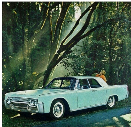
Pure elegance...with a two-year/24,000 mile pledge of excellence*