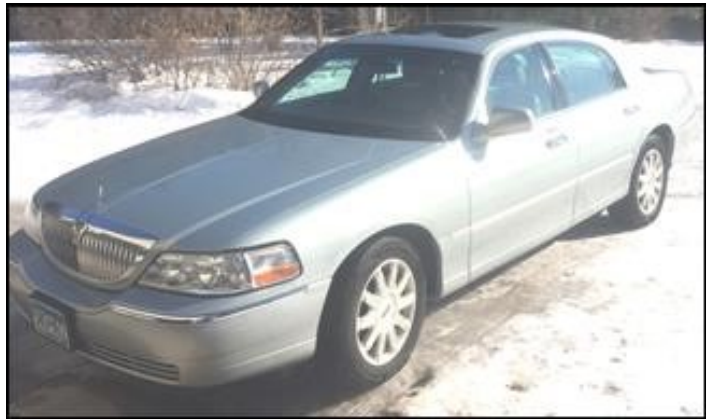
The Mehr's newer road car is a 2007 Lincoln Town Car.

Their 1924 Model T Touring Car was used at their wedding in 1968, and at the weddings of each of their seven children. The Mehrs like convertibles. Their 1963 Pontiac Lemans, 1963 Pontiac Catalina, 1959 Metropolitan, and 1960 Lincoln Mark V are all convertibles. They recently sold a beautiful 1963 Thunderbird convertible and an awesome 1936 Chevrolet Coupe to make room for the 1960 Lincoln, currently being restored. When not cruising down the road in a convertible, Jerry enjoys getting behind the wheel of a 1932 Irish Fordson Tractor to do some neighborhood vintage plowing. Their 17 grandchildren enjoy parading in a Model T go-kart that was built in 1959. Jerry enjoys wood working in the winter and working on cars and enjoying car events in the summer. Carole and Jerry have been retired for 19 years and enjoy traveling.