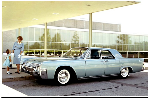
The all new Continental for 1961.