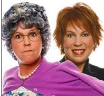
Vicki Ann Lawrence American television and entertainment icon.

Vicki Ann Lawrence, born March 26, 1949, sometimes credited as Vicki Lawrence Schultz, is an American actress, comedian, and pop music singer known for the many characters she originated on CBS's The Carol Burnett Show , where she appeared from 1967-78, for the entire series run. One such character was "The Family" matriarch Thelma Harper/Mama , the cold, unaffectionate mother of the neurotic, misfortunate, Eunice (Burnett) although Lawrence is 16 years younger than Burnett. Thelma Harper was the central character of the television situation comedy series Mama's Family on NBC and, later, in first-run syndication. She also starred in the Fox sitcom series The