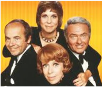
The Carol Burnett show cast.