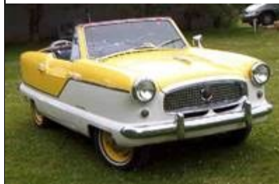
Sometimes fun comes in small packages.