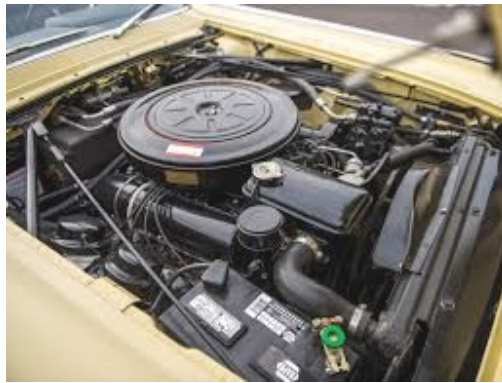
1961 Continental engine bay.

ferred in only two body styles, a four-door sedan and a four-door convertible. There never was a coupe even though Lincoln had offered two-doors since 1936. There was only one series for the first time since 1939. Both body styles were set on a 123" wheelbase, down from a 131" wheelbase for the previous three years. The engine remained the 430 introduced in 1958. Horsepower was down from 315 to 300, still with a Carter two-barrel carburetor.