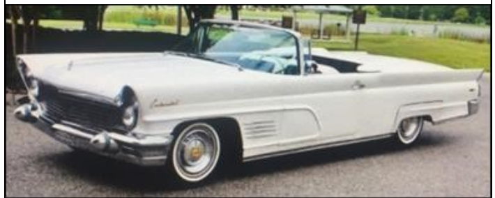
Jerry's latest project is a 1960 Continental Convertible.