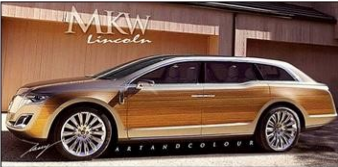
The all new "Welcome Wagon."