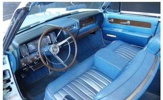
1961 Continental dash and interior.

Engel knew basically what he wanted—two vertical blades or pontoons with a Continental style greenhouse nestled between them. He wanted a thin stainless peak molding running the entire length of the car. While the car would not be a recreation of the Continental Mark II, it would have some of the flavor of that now discontinued car. In its final form, the Continental styled Thunderbird had a peak molding slightly raised at the trailing end of the front doors, a grille similar to that of the 1963 Buick Riviera and a low-slung Continental spare tire hump built into the rear deck and bumper. This was later modified to a rear treatment similar to the 1961 Thunderbird with the jet style tail lights and then rear grille nacelle very similar to what emerged on the 1961 Lincoln Continental. Actually, the designers did two finished full-sized Thunderbird clay models.