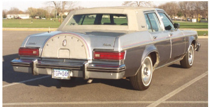
The very distinctive look of the Lincoln Versailles

A few days later I and a friend returned to Avon to get the car. As I enjoyed the drive back to Willmar I thought it was great to have another Lincoln to display at the outstate Lincoln Show in Willmar in May. There are not too many Versailles' around. A little TLC would make it very presentable. The fine fall weather allowed me to clean, vacuum, and polish up the car before taking a few pictures. I only drove it about 250 miles before I parked it in my storage building.