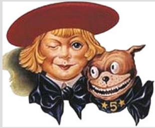
Buster Brown and his Dog Tige

He was a little rich kid with a blond page-boy haircut who was always getting into mischief, but also had a serious side. One hundred and five years ago, Buster Brown and his dog Tige made their debut in a Sunday comic strip in the New York Herald. The pair soon appeared in newspapers around the country and went on to become even more famous when the Brown Shoe Co. adopted them as mascots.