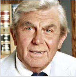
Andy Griffith 1926 - 2012

Andy Griffith was starring on Broadway in the 1959 musical comedy "Destry Rides Again" when he told his agent that he was ready for a new challenge: He wanted his own television series.