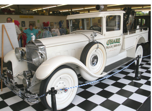
A late 20's Packard long wheelbase sedan converted for towing service.

very nicely exhibited. From the teens through the '70's or 80's, large and small, all completely restored and looking as though they had never dropped the hook down to tow a car. The smallest was a two cylinder vehicle with a small bed and a small tow mechanism installed. I am guessing that about all it could tow would be a motorcycle. One of the largest ever built was also there. It looked as though it could easily pull the largest eighteen wheeler ever made, filled with gold bars. They even had a small pickup based tow truck from Sauk Rapids, MN.