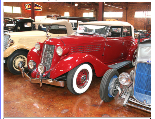
A great looking Auburn in the Coker Tire collection

Friday morning was another tour, this time by bus. The bus was a big charter unit, which the driver skill-fully maneuvered through the some what narrow streets of Chattanooga to our first stop, the Coker Tire Company. Housed in a very old building, Coker does not manufacture any tires there.