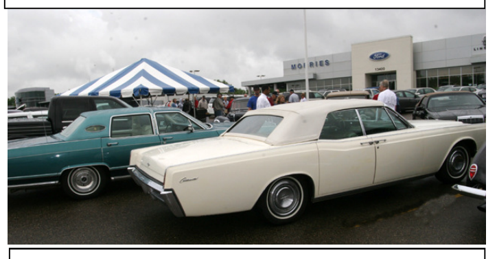
A perfectly dreary day for our annual car show.

Eventually the weather cleared and the rain stopped. It was on the cool side, with temperatures in the '60's. If you had a jacket, you were good. About 11:00AM, the grill was fired up and Morries folks grilled hot dogs for us. The were good and they had to make another run to Costco to pick up