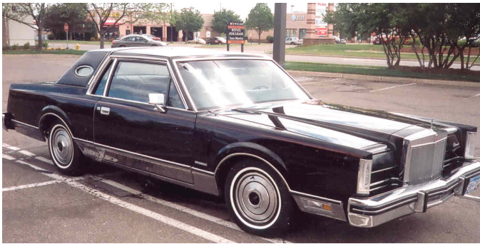
1981 Continental Mark VI Two door coupe with sun roof

Black exterior with black leather interior New white side wall tires Recent work includes new A/C compressor and radiator. 80,400 miles, car is in like new showroom condition. This fine Lincoln is from the former Bob Bliss collection in Faribault.