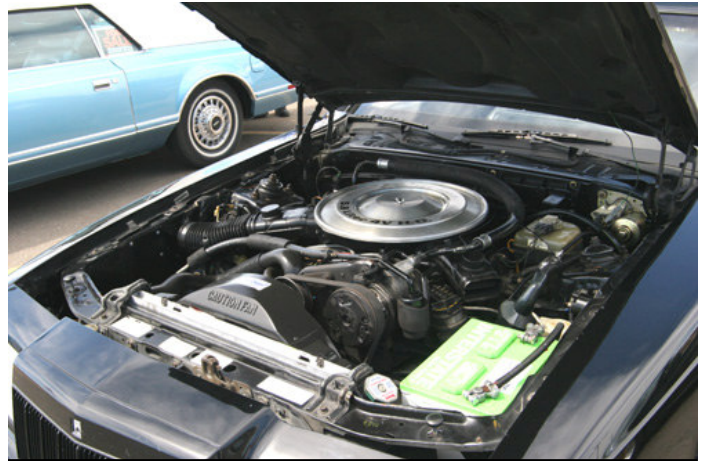
No garden variety MK VII engine here, lurking under the hood is a 351 Windsor block.

The first time I heard of the GTC option I thought to myself, "That's the coolest Mark VII I'll NEVER see". Well, when I decided that I absolutely had to replace a Mark VII that I had owned years ago, I stumbled across an ad on Craig's List of all places. The ad was a "1986 GTC 5.8L" in Everett, Washington.