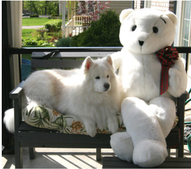
Ch. Faithie, the ever gracious hostess, is trying to find a nice way to tell her friend the polar bear, who has been visiting at 308 Brandywine Drive, that summer is here and it is now time to blow town.

man cars, such as BMW and Mercedes. Please stop by Morrie's or one of the other fine Lincoln dealerships and ask them show you the new MKS. I think that you will be very pleased.