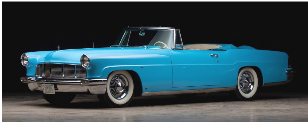
The Goeppinger Mark II Custom Convertible will be auctioned off at the Sotheby Monterey auction this coming August.