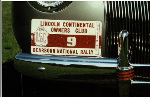
Dearborn meet special plate number 9.