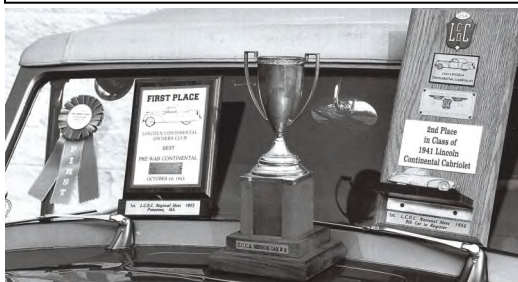
Close up of the trophies.