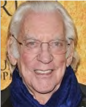
Donald Sutherland Canadian Actor 1935 -

Donald McNichol Sutherland is a Canadian actor whose film career spans over six decades. He has been nominated for nine Golden Globe Awards, winning two for his performances in the television films Citizen X (1995) and Path to War (2002); the former also earned him a Prime-time Emmy Award. An inductee of the Hollywood Walk of Fame and Canadian Walk of Fame, he also received a Canadian Academy Award for the drama film Threshhold (1981). Multiple film critics and media outlets have cited him as one of the best actors never to have received an Academy Award nomination. In 2017, he received an Academy Honorary Award for his contributions to cinema. In 2021, he won