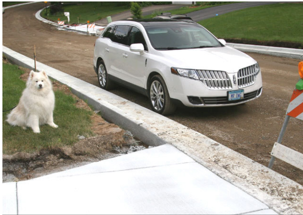
Sweet Faithie is admiring the new curbs which were installed in front of 308 Brandywine. She has been carefully supervising the workers to make sure they do a perfect job. She is hoping dad will take her for a short ride in the MKT.

running from the very, very warm (over 103 degrees) to needing jackets to feel comfortable. We just sort of got cheated out of a month of our precious summer.