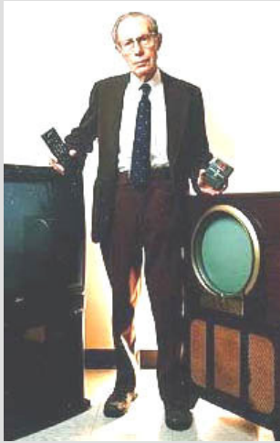
Dr. Robert Adler 1913– 2007 Helped to create the “Couch Potato”

Dr. Robert Adler is best known as the "Father of the TV Remote Control". He developed the first television remote control which was introduced in 1956 by Zenith Radio Corporation.