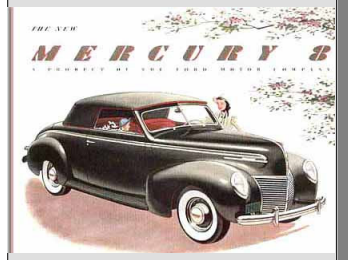
The All New 1939 Mercury Eight

Well if I had money Tell you what I'd do I'd go downtown and buy a Mercury or two Crazy 'bout a Mercury Lord, I'm crazy 'bout a Mercury I'm gonna buy me a Mercury And cruise it up and down the road. The "Mercury Blues" sung by Allan Jackson.