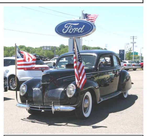
Ford, flags and Lincoln Zephyr. What could be more American?

WOW, what a turn out for our Second Annual Lincoln Car Show at Morrie's Minnetonka Ford-Lincoln-Mercury on Saturday May 29<sup>th</sup>. Saying this show was an overwhelming success just does not describe the Lincolns, the fellowship and the fun we had. We enjoyed some of the best weather of the year, with 90 degrees and a good breeze for the whole day. Two open tents were on hand to shield us