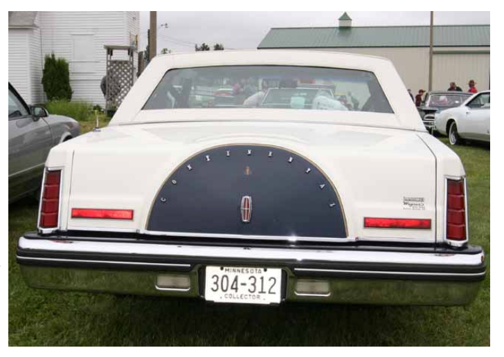
(Continued on page 12)

As this is a show that many of us had never attended before, it was an excellent chance to see some cars that we had not seen before. A black and white 1956 Cadillac convertible was parked next to our group. It appeared to be mostly original and in fine condition. You just can't beat those mid-fifties Cadillac cars for styling and just being overall eye catchers. Also, not too far from us was a very fine, nicely restored, red Chrysler 300F two door hardtop. One of the original muscle cars, the F featured a 413 Wedge engine, rated at 375HP or for those from across the sea, 280 Kilowatts. It came equipped with a "cross-ram" induction manifold to which two (count them) two four barrel