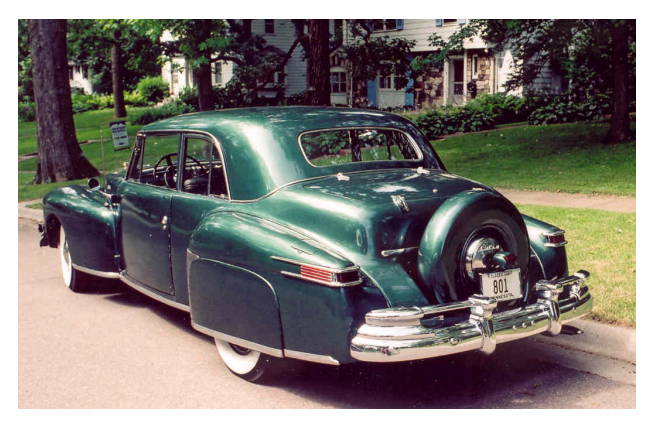
Please note reduced price.

Solid driver with good starting and running original V12 and overdrive.