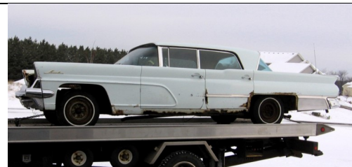
Bill's Lincoln at the beginning of the project, it needed everything.....