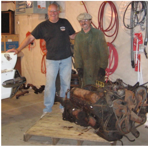
One tired old engine is about to get a complete rebuild.