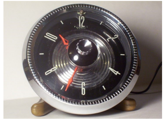
Above - a new old stock 1955 Ford clock, a companion to the 1955 Ford radio control.

early features are still with us, including pushbuttons (now just accessing digital memory registers) and signal seek. Most new radios have an interesting refinement: If in seeking they find no local stations, they automatically step down to accept a lower signal strength, a useful feature in some of the remaining great outback of America. As our time spent in automobiles increases thanks to traffic congestion and longer commutes, our time spent involved in mobile audio is going up too. Some sound aficionados find factory-standard gear to be lacking and will spend thousands on "sound tuning" upgrades.