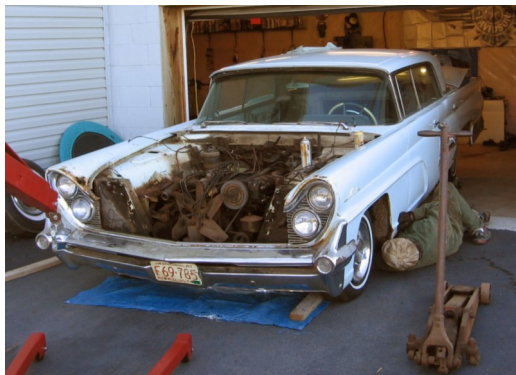
Getting ready to pull the engine from the '59.