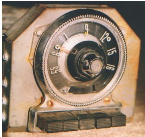
The radio shown above is from a 1955 Ford. Very stylish and functional in design. It fit well in the dashboard.

that set the frequency. Ordinarily a station was tuned in, then the button allocated to that station was pulled out and then pushed back in, fully memorizing the mechanical setting. Broadcasters picked up on pushbuttons and station loyalty; they started urging listeners to make their station "the number one button on their car radio!" The first appearance of the "signal seeking" radio was in the early 1950s, with two unique wrinkles. Most of these radios had a switch marked "Town and Country," to set whether you wanted the radio to find only local stations or any receivable signal. A second innovation was a switch under the carpet for the left foot that would be depressed by the driver momentarily (we don't want to add to the distractions). A little motor would start tuning the radio up the dial. The AGC circuit in the radio would tell the motor to stop on the strongest or any station depending on your town/country choice.