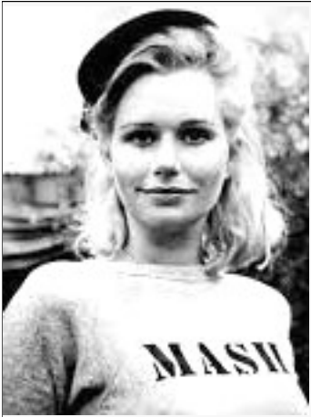
Sally Kellerman American Actress 1937 - 2022

Sally Clare Kellerman was an American actress and singer whose acting career spanned 60 years. Her role as Major Margaret "Hot Lips" Houlihan in Robert Altman's film M*A*S*H (1970) earned her an Oscar nomination for Best Actress in a Supporting Role.