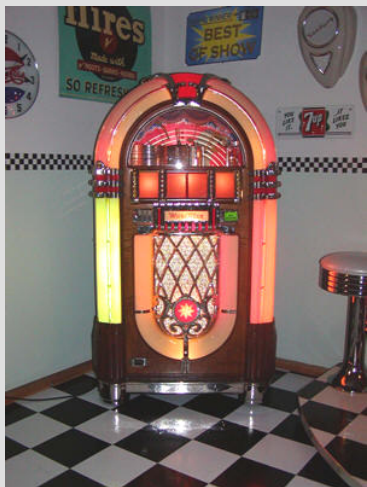
The Famous 1015