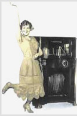
The Tonophone, a coin operated piano.

Shortly after the turn of the 20th century, Wurlitzer became famous for the large theater organs that created sound for silent films. These large organs and many other types of automatic instruments were manufactured at a large facility in North Tonawanda, N.Y., where the factory still stands today. Rudolph Wurlitzer died in 1914, leaving the business to his three sons. As the demand for theater organs and automatic pianos weakened, Wurlitzer went through some difficult times. The depression of 1929 nearly put the company out of business. The 'Mighty Wurlitzer' is still well-known.