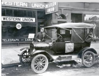
Western Union Delivery Vehicle, Circa 1920

Department of Defense, used the company to notify families of the death of their loved ones serving in the military. Telegrams reached their peak popularity in the 1920s and 1930s when it was cheaper to send a telegram than to place a long-distance telephone call. People would save money by using the word "stop" instead of periods to end sentences because punctuation was extra while the four character word was free.