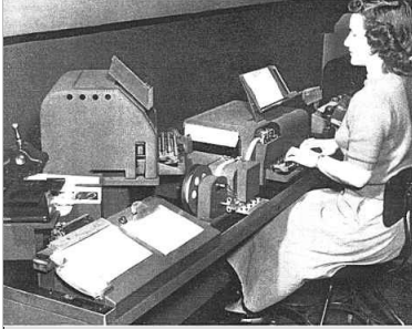
Western Union Operator typing messages onto perforated tape for transmission.

(Continued from page 5) offering Telex to customers. In 1964, Western Union initiated a transcontinental microwave beam to replace land lines.