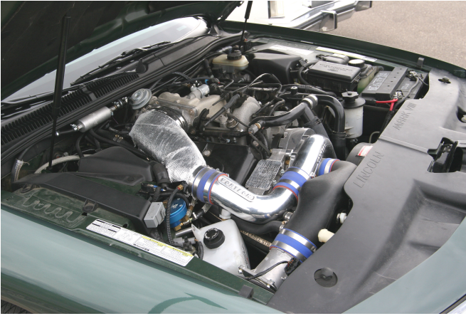
A supercharger turns this Mark VIII into a real hot rod Lincoln. It just has to be fun to drive.