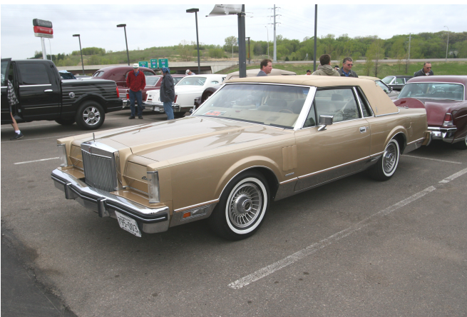
A nice looking Mark VI, new to the club. This is a good example of affordable Lincolns which would do well in LCOC competitions. Better buy them up now before the kids discover how great they are.