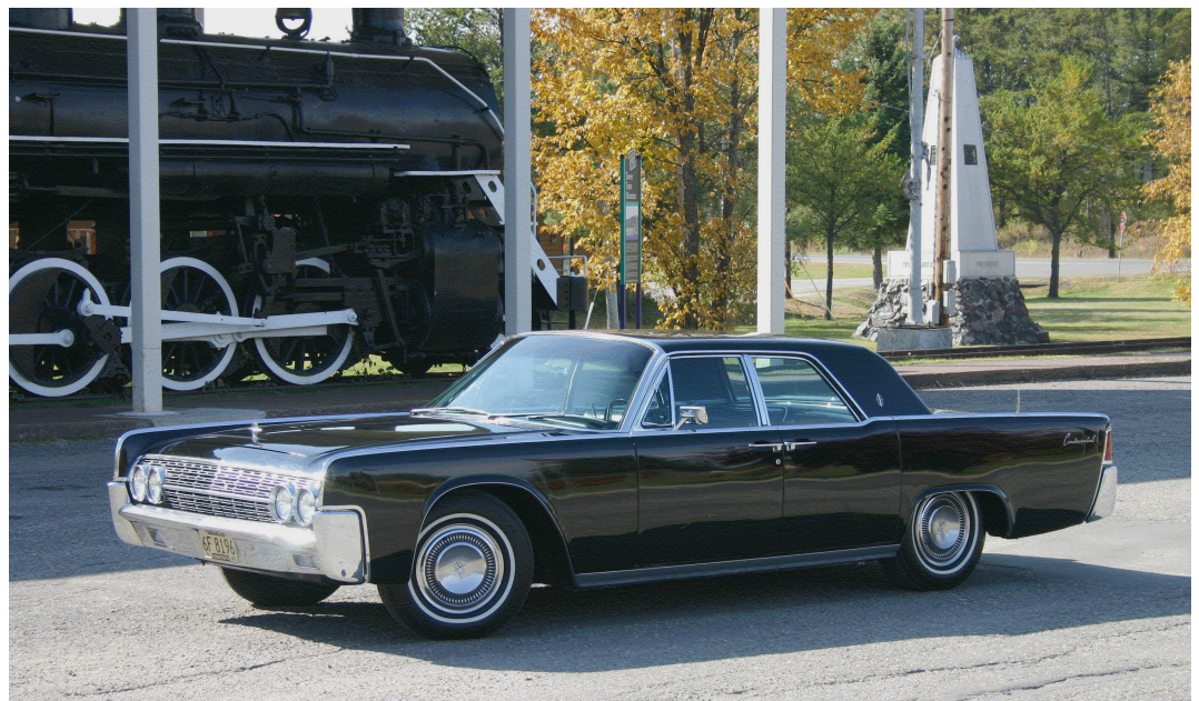
Our Beverly Hills Lincoln at Giant's Ridge

Welcome to the Northstar News, the monthly publication of the Northstar Region of the Lincoln and Continental Owners Club. We value your opinions and appreciate your input concerning this newsletter and the operation of the club. This is your club.