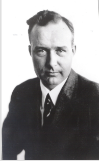
Thomas Midgley, Jr

At first, Thomas Midgley, Jr. didn't want to work on the project that would end up making him an integral part of automotive and aviation history. Because he was trained in engineering, not chemistry, Midgley initially protested his involvement in the study of "knock," which was the audible malfunction of gasoline engines that inhibited performance and efficiency.