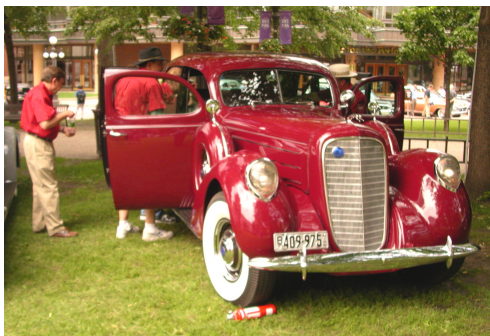
Tom Brace's 1937 K Two Window

Full Classic Closed 1939 and older 2nd Tom Brace