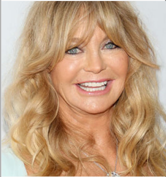
Goldie Hawn American Actress A very funny lady

Goldie Jeanne Hawn (born November 21, 1945) is an American actress, producer, dancer, and singer. She rose to fame on the NBC sketch comedy program Rowan & Martin's Laugh-In (1968-70) before receiving the Academy Award and Golden Globe Award for Best Supporting Actress for her performance in Cactus Flower (1969).