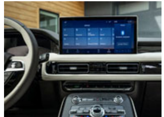
The beautiful, easy to read and operate 13.2 inch touch screen display.

Lincoln's Nautilus midsize luxury SUV gets a new interior and significant connectivity improvements when the 2021 model arrives in dealerships early next year. The Nautilus will also go into production then in China, a growing market for Lincoln. North American versions of the SUV will continue to come from the Oakville, Ontario, plant that's always built the Nautilus and its predecessor, the MKX.