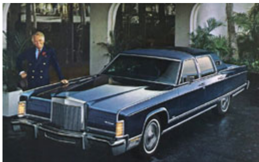
The 1977 Lincoln at it's finest.

We invite you to continue your involvement with the LCOC and the North Star Region. We really need your support and this is one way of showing it. Show your Lincoln off, new or old, let us see it. A good way to break up the doldrums now facing us for the foreseeable future. We are here for you, let us all work together to help build our club. Also, a LCOC membership makes a nice gift for those who love cars. Surprise one of your friends with the wonder gift of a years membership to our fine club