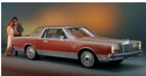
The all new 1980 Mark VI