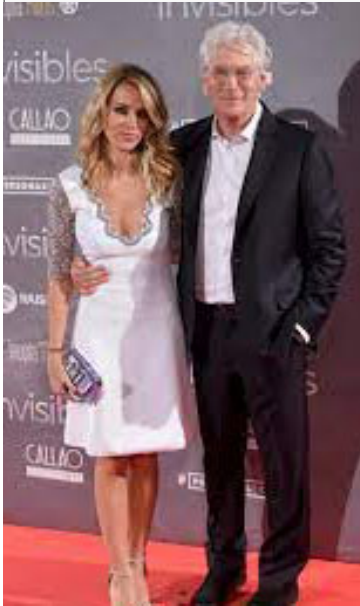
Richard Gere with wife Alejandra Silva.