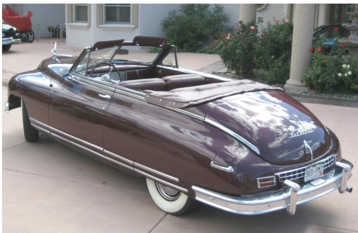
1948 Packard Custom Victoria Eight convertible.

By the time these Eights came along, the competition was bringing out new cars with new styling, and Packard was at a disadvantage. Packard, therefore, reskinned the cars below the greenhouse to eliminate the vestiges of fender sweeps. The cars looked bulbous, yes, but the massive look was definitely in for American buyers. These 1948-50 cars gave Packard financial breathing room until all-new cars could be developed for 1951, but even though they were a stopgap measure, they are respected now.