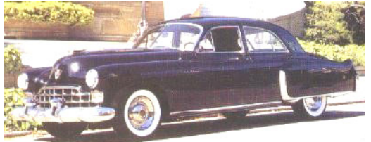
1948 Cadillac Fleetwood 60 Special

Power comes from the venerable 323.5cu in straight-eight side valve motor. A good engine which would be retired at the end of 1950, replaced by the magnificent FirePower Hemi V8. Only the Chrysler Town & Country, with its wooden body, was seen as a more luxurious model. Chrysler's styling is conservative compared with what was to come in the following decade! Peter says the Chrysler cruises nicely at 70mph. Original tube radio. Mileage stands at 95k. Rear courtesy light. Black paint sets off the chrome nicely. New Yorker was one of the top Chrysler models. Fluid Drive was a form of semi-automatic transmission, Chrysler's first attempt at shiftless driving. Fine details are plentiful in this high quality automobile.