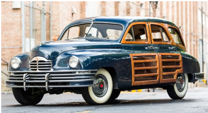
A very stylish alternative to the somewhat clunky station wagons offered by other manufacturers was the Packard Station Sedan.

all cars saved money and modernized the styling of the senior cars at a minimal cost. It also allowed for all cars to be produced on one assembly line.