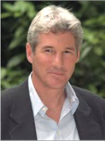
Richard Gere American Actor

Richard Tiffany Gere (born August 31, 1949) is an American actor. He began in films in the 1970s, playing a supporting role in Looking for Mr. Goodbar (1977) and a starring role in Days of Heaven (1978). He came to prominence with his role in the film American Gigolo (1980), which established him as leading man and a sex symbol. His other films include An Officer and a Gentleman (1982), The Cotton club 1984), Pretty Woman (1990), Sommersby (1993), Primal fear (1996), Runaway Bride (1999), I'm Not There (2007), Arbitrage (2012) and Norman (2016). For portraying Billy Flynn in the musical Chicago (2002), he won a Golden Globe Award and a Screen Actors Guild Award as part of the cast.