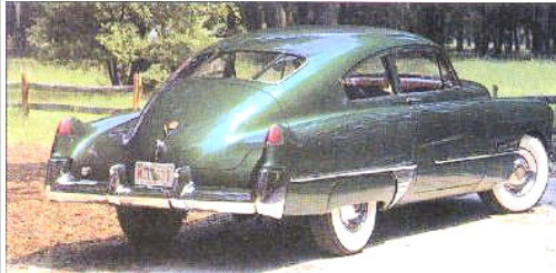
One of the best looking cars for 1948. The Cadillac SSeries 62 Sedanette, 2 door coupe.