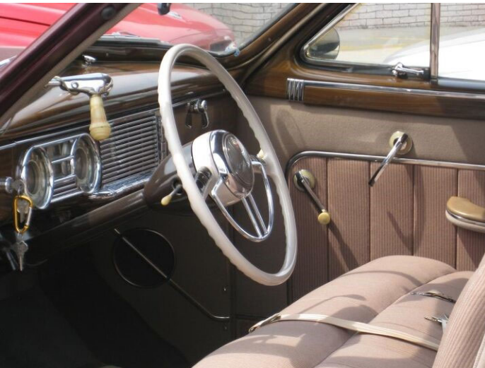
1948 Packard interior. Packards always featured the best of materials and very refined luxury.

Though the old Packard plant on East Grand Boulevard is a clichéd symbol of Detroit's ruin, the factory's two famous limestone facades have been saved by Dayton's Packard Museum and by the Packard Motor Car Foundation. The Museum paid $161,000 at auction for their remnant in 2008, and crews subsequently removed it for eventual reassembly in Ohio. The foundation plans on eventually displaying the other edifice at the Packard Proving Grounds, in suburban Detroit, which the foundation owns and is restoring.