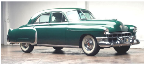
The top of the line.... The Fleetwood 60 Special sedan. For those who have arrived....

The Series Sixty-One and Sixty-Two, actually a bit shorter than the same models of the previous year, each offered a two-door fastback club coupe, or "Sedanet." The almost-a-Boattail coupes of 1948-49 were arguably the most beautiful postwar fastbacks ever built. The Sixty-Ones and Sixty-Twos differed only slightly in trim — no chrome rocker panel moldings or front fender stone shields for the Sixty-One, for example — but shared the same sheet metal and 126-inch wheelbase. Hershey had indeed wrought some magic, because the 50mm-narrower cars were 50mm wider inside, where buyers really appreciated it.