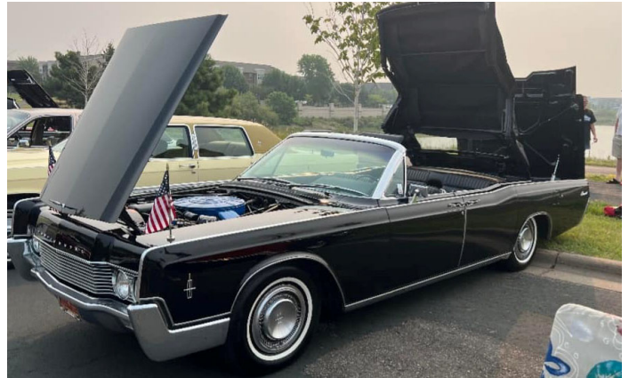
Chris Struble opened up his Continental convertible for all the world to see.