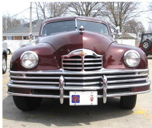
1948 Packard 8 four door sedan.

of a small dealership that could hold only about three cars in its showroom. Not flashy and with little advertising, the same people came back every time they needed a new car. When Packard announced their new models for 1955, the Sneve company quietly closed its doors. It was a very sad time for Duluthians who owned Packards. The following story about 1948 Packards was found on the internet and first appeared in "Cars in Depth" April 2011.