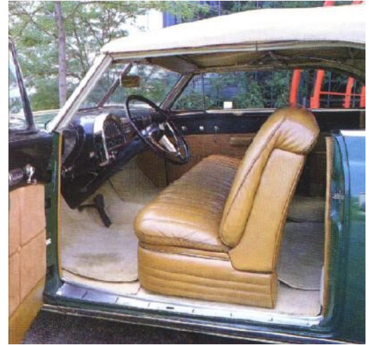
Cadillac Series 62 Convertible interior.

was there to be bought in any Cadillac showroom. With that beautiful line flowing through the body panels, climaxing in the elegant tailfins that gave the effect of making the car look longer, the sheer beauty and simplicity of the car's body took many an onlooker's breath away. The rounded bumpers and curved windshield only added to the car's sleek styling. In 1948, Cadillac was the luxury car to own.