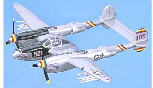
The P-38 Lightning was the inspiration for the design of the restyled 1948 Cadillac.

When the story of the '48 Cadillac is told, the influence of the plane's tailfins is usually the predominant theme. However, the effect of the plane's design encompassed much more than that. Mitchell said, "You have to understand the value of what we saw in that plane's design. We saw that you could take one line and continue it from the cowl all the way back to the tip of the tail — that you could have one unbroken, flowing line."