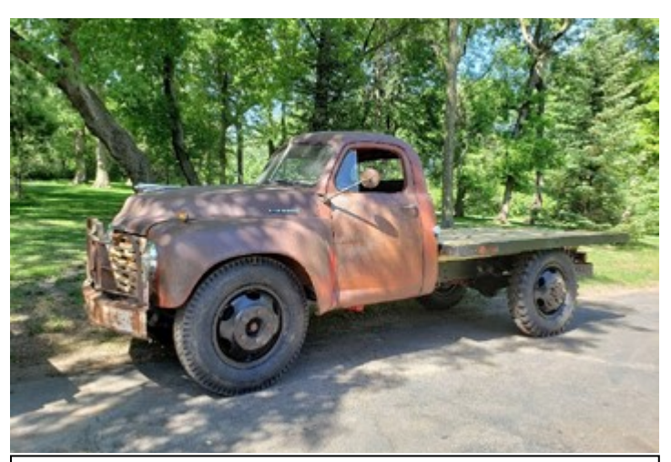
A proper work truck is this 1949 Studebaker; a 1-ton pickup also occupies space in Nels garage.

My 1949 Lincoln is actually my second classic vehicle. I also have a '49 Studebaker 2R-15 (1 ton) pickup truck that I purchased down in Kansas. I rebuilt the original hi-torque brake system, wired the engine, full tune-up, and built a flatbed. It's a great little truck and fires right up. I enjoy working on these older cars and am currently trying to save up for my own little dealership/repair shop now that I am done with school. I work on classics whenever I can. I'm hoping the club will have some members who need their cars repaired. I have a truck and trailer, so loading/delivery isn't an issue. I also have a garage at home, which I can work out of with ample space. I graduated this May from WITC in New Richmond, WI, with an associate degree in diesel mechanics. I also previously spent two years at the restoration school of McPherson College in McPherson, Kansas.