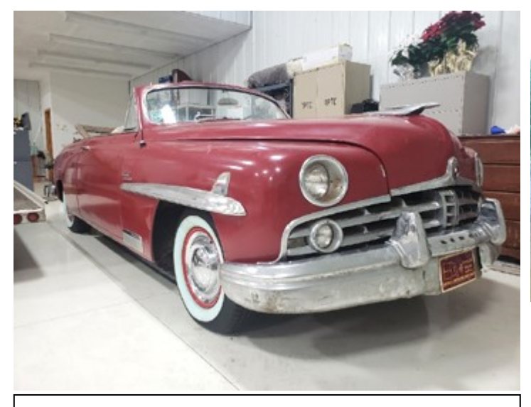
Nels Wood's very rare 1949 Lincoln Cosmopolitan