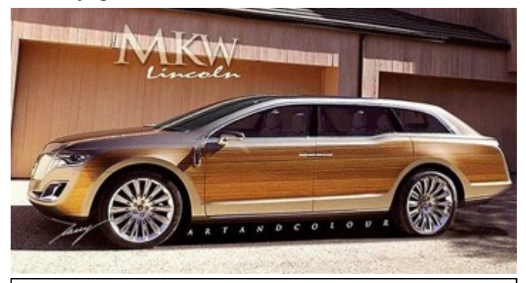
The North Star Welcome Wagon