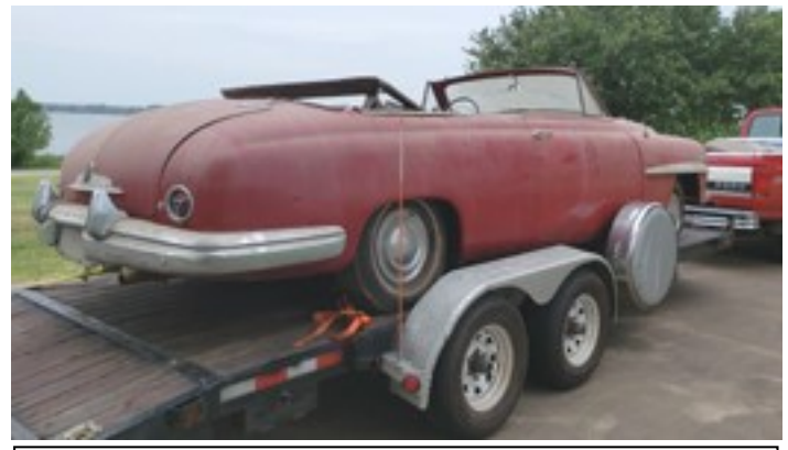
A somewhat sad-looking Cosmopolitan going home

Inside was parked a bright red '1949 Lincoln convertible. I had never seen a Cosmopolitan until this day, and the moment I laid eyes on the convertible, I absolutely fell in love. The red, still glossy under the dust. 337 Flathead V8 with a 3 Speed Man-