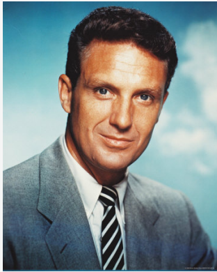
Robert Stack 1919 - 2003

Robert Stack (January 13, 1919 – May 14, 2003) was a multilingual American actor and television host. In addition to acting in more than 40 feature films, he starred in the 1959–63 television series The Untouchables and later hosted Unsolved Mysteries from 1987 until 2002.