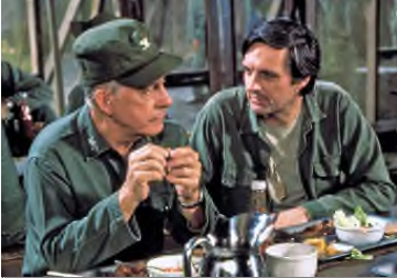
Harry Morgan and Alan Alda both starred in M*A*S*H

Stevenson's character Henry Blake, Potter was a career Army officer who was a firm yet good-humored, caring father figure to those under his command.