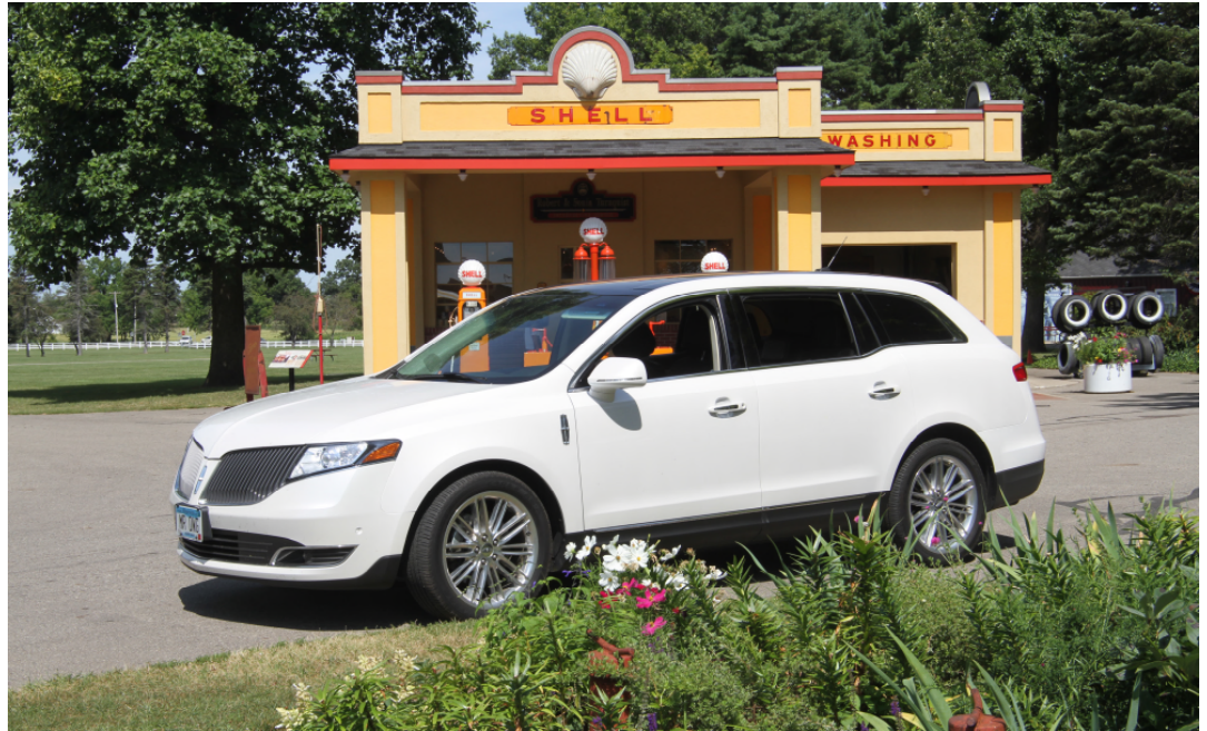
Your editor's MKT at Hickory Corners, Michigan

Welcome to the Northstar News, the monthly publication of the Northstar Region of the Lincoln and Continental Owners Club. We value your opinions and appreciate your input concerning this newsletter and the operation of the club. This is your club.