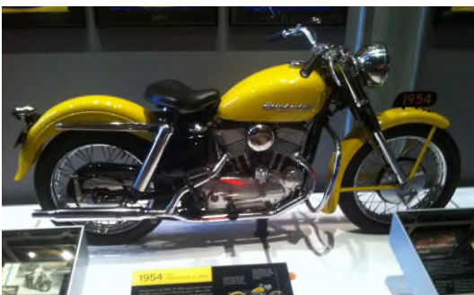
1954 Harley V Twin