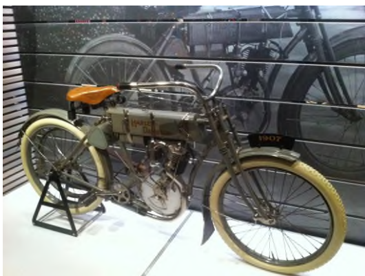
1907 Harley Davidson prototype