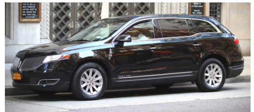
A subset model designated "MKT-Town Car" was offered for those engaged in Livery service. Note the "Town Car" on the left fender pictured below.

Trim - From 2010 to 2016 (with the exception of the Town Car livery variants) the Lincoln MKT was not sold by trim level, with examples largely identified by their engine and drivetrain configuration. To bring the MKT in line with other Lincoln vehicles, for 2017, the MKT adopted a Premiere base model, with the Reserve as the top-trim model. For the 2019 model year, Lincoln dropped the naturally aspirated 3.7L Duratec engine from the trim lineup making the Twin-Turbocharged 3.5L V6 EcoBoost the sole engine.