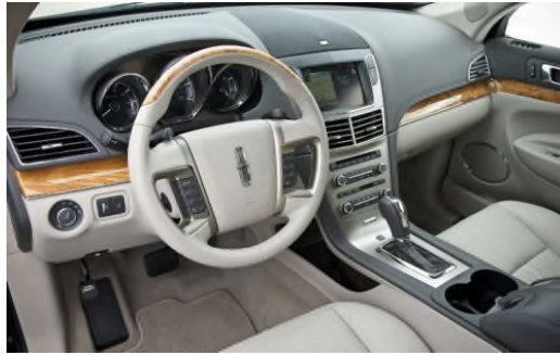
Lincoln MKT dash and front seat area.

made it possible to extend production for a longer period than would be normally expected.