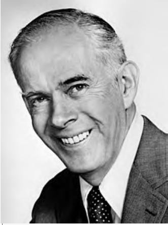
Harry Morgan American Actor 1915 - 2011

Harry Morgan (April 10, 1915 - December 7, 2011) was an American actor and director whose television and film career spanned six decades. Morgan's major roles included Pete Porter in both December Bride (1954-1959) and Pete and Gladys (1960-1962); Officer Bill Gannon on Dragnet (1967-1970); Amos Coogan on Hec Ramsey (1972-1974); and his starring role as Colonel Sherman T. Potter in M*A*S*H (1975-1983) and AfterMASH (1983-1985). Morgan also appeared in more than 100 films.