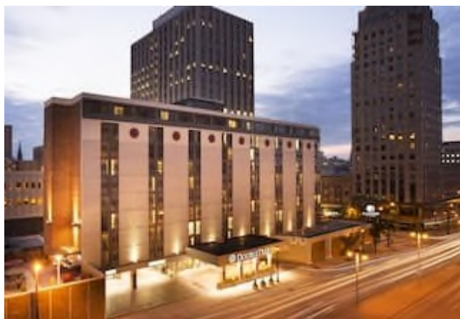
Milwaukee Double Tree Hotel

Meet in the morning for breakfast at 9 a.m. After a leisurely visit with good friends over that second cup of coffee, we will bid adieu to the great city of Milwaukee, and then, head on home with a lot of great memories.