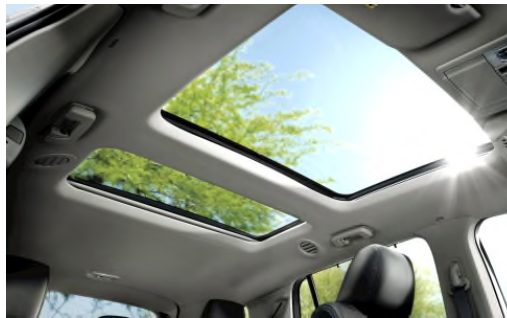
Most MKTs were equipped with the optional sun roof package. Lots of glass overhead.

The MKT featured electric power steering over more-traditional hydraulic power steering. The electric steering system is combined with ultrasonic sensors to form a hands-off "Active Park Assist" system that steers the vehicle into parallel parking slots.