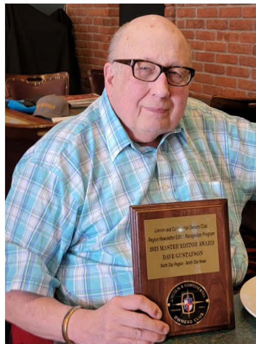
Your editor with his LCOC newsletter award. We might be better served by having an award given out to our members for having to read these newsletters over this past 20 years.

serves to help connect our members to the club.