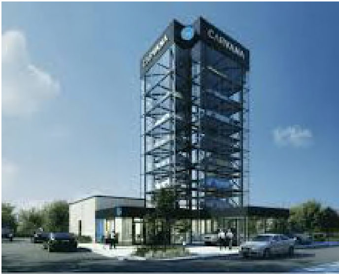
The BobVana Lincoln car dispensing machine will come to Shafer to serve the needs of the classic car collector.