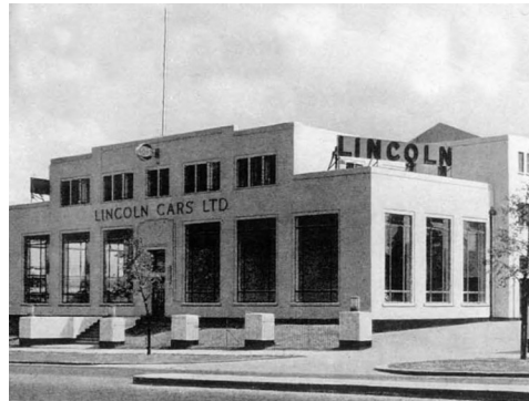
Lincoln of Shafer

From the Shafer Daily Bugle, by Bob Woodward. Pictures by Matthew Brady.