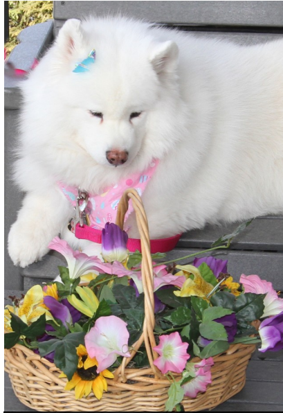
Sweet Olga is checking out the pretty basket of Spring flowers left by the Easter bunny. She reports that she would forgo the flowers any day for a basket of good dog treats. Dad, can you clue in the Easter bunny for next year. Girls like flowers, but treats are much better.

pounds of torque, it will easily pull over 8,000 pounds at the hitch. It comes with a 23 gallon gas tank, so expect a dent in the wallet when filling up the fuel tank. This is a very large SUV, and it is also very