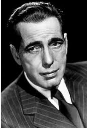
Humphrey Bogart American Actor 1899 - 1957 Here's Looking At You, Kid.

Actor Humphrey Bogart became a legend for his roles in 1940s-era films like Casablanca , The Maltese Falcon and To Have and Have Not . Humphrey Bogart was born December 25, 1899, in New York City. He began his career on Broadway in the 1920s. This led to B-movie parts in 1930s Hollywood. Bogart's turning point came in the 1940s, with his legendary roles in The Maltese Falcon and Casablanca . He married several times throughout his life, with his last wife being actress Lauren