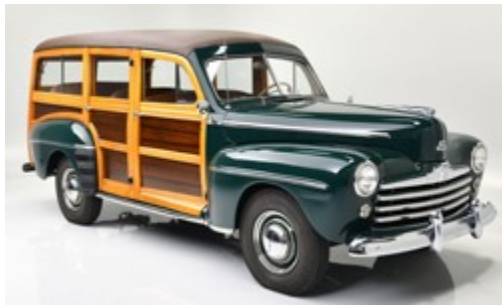
Edsel Ford's 1947 woody wagon