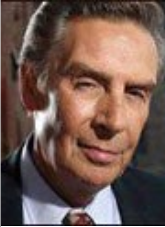
Jerry Orbach American Actor 1935 - 2004

Jerome Bernard Orbach (October 20, 1935 - December 28, 2004) was an American actor and singer, described at the time of his death as "one of the last bona fide leading men of the Broadway musical and global celebrity on television" and a "versatile stage and film actor."