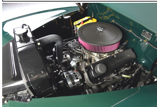
A very modern Ford 302 engine makes for a great running 1947 woody wagon.

Ford was named to the NASCAR Hall of Fame in 2020 and was a recipient of the Hall of Fame's Landmark Award for his outstanding contributions to motorsport.