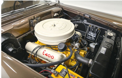
Exclusive to the Edsel line, this Bermuda was equipped with a 361 cubic inch engine.

Then there is the beautiful 1958 Edsel Bermuda Wagon (Lot 1341.1), a rare gem known as "Edsel's Edsel." Modified and restored by Roush in 2016, the single-production-year Bermuda represents the top-of-the-line station wagon offered by Ford Motor Company's bold but short-lived, mid-tier Edsel marque. Under the hood is the Edsel-exclusive 361-cubic-inch "E-400" V-8, named for its impressive output of 400 lb-ft of torque. Fed by a four-barrel carburetor and boasting a 10.5:1 compression ratio, the V-8 makes 303 horsepower.