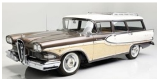
Edsel Ford's 1958 Bermuda Wagon