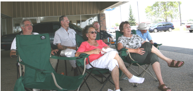
Club members trying to escape from the heat!