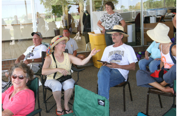
Northstar Members taking shelter from the sun