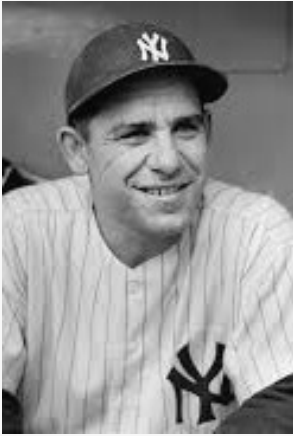
Lawrence Peter "Yogi" Berra 1925 - 2015

Lawrence Peter "Yogi" Berra (May 12, 1925 - September 22, 2015) was an American professional baseball catcher, who later took on the roles of manager and coach. He played 19 seasons in Major League Baseball (MLB) (1946-63, 1965), all but the last for the New York Yankees. He was an 18-time All-Star, and won 10 World Series championships as a player—more than any other player in MLB history. Berra had a career batting average of .285, while hitting 358 home runs and 1,430 runs batted in. He is one of only five players to win the American League Most Valuable Player