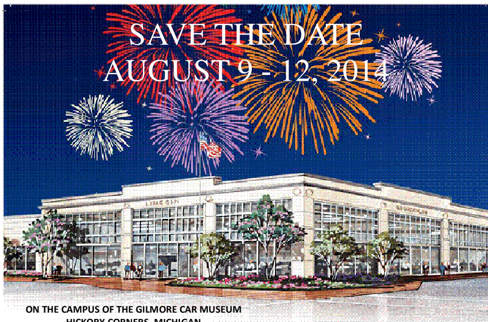
ON THE CAMPUS OF THE GILMORE CAR MUSEUM HICKORY CORNERS, MICHIGAN