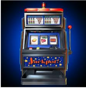
History of the Slot Machine

Sittman and Pitt of Brooklyn, New York, U.S. developed a gambling machine in 1891 which was a precursor to the modern slot machine. It contained five drums holding a total of 50 card faces and was based on poker. This machine proved extremely popular and soon many bars in the city had one or more of the machines. Players would insert a nickel and pull a lever, which would spin the drums and the cards they held, the player hoping for a good poker hand. There was no direct payout mechanism, so a pair of kings might get the player a free beer, whereas a royal flush could pay out cigars or drinks, the prizes wholly dependent on what was on offer at the local establishment. To make the odds better for the house, two cards were typically removed